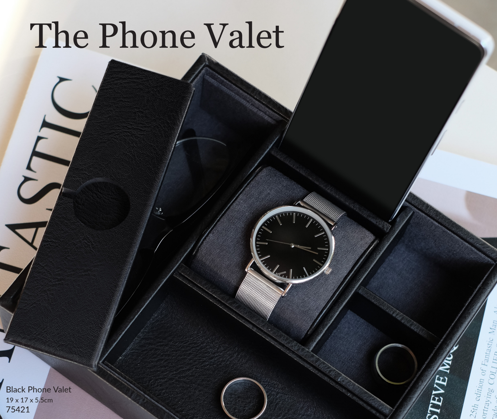
Black Phone Valet 19 x 17 x 5.5cm 75421