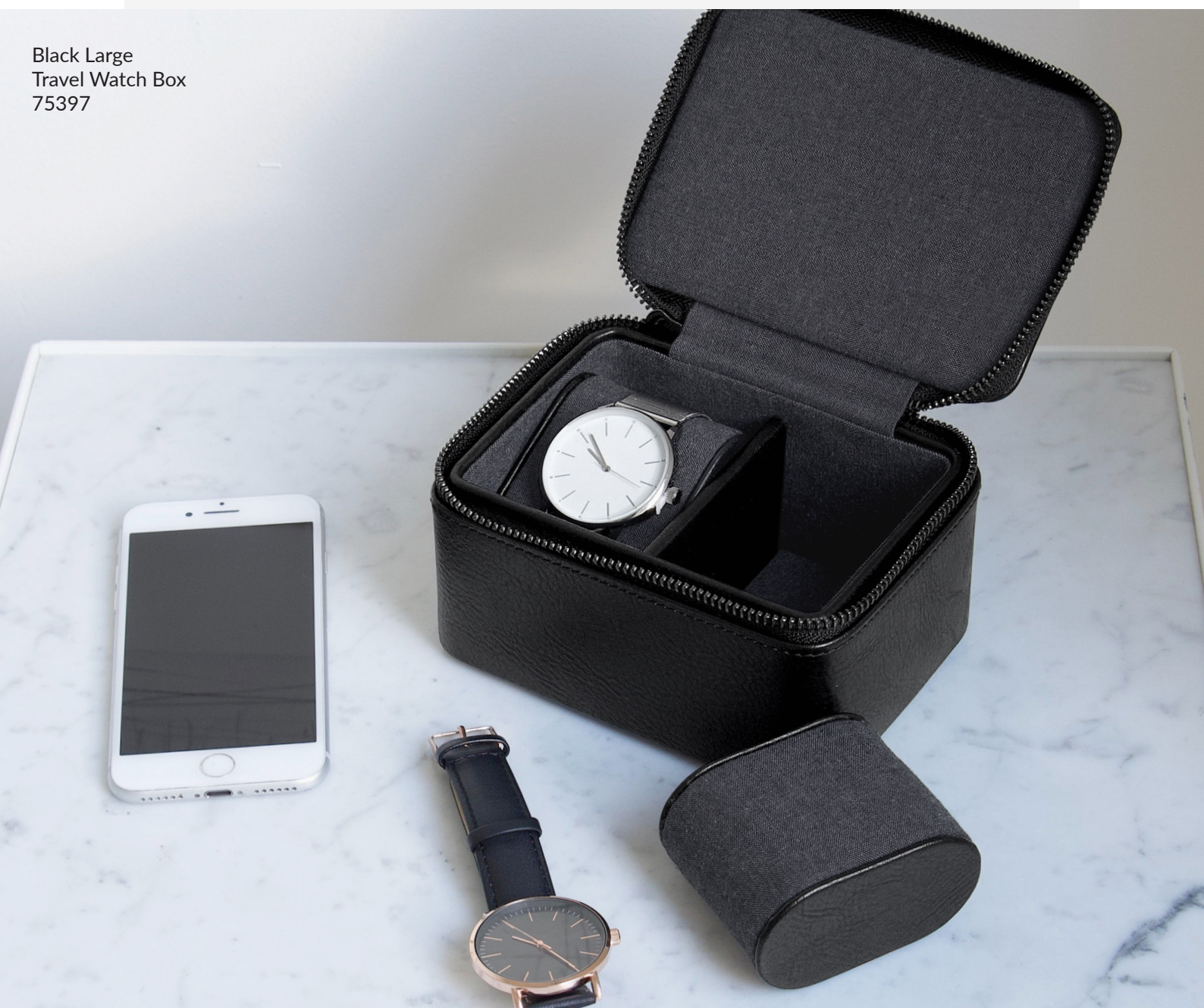
Black Large Travel Watch Box 75397