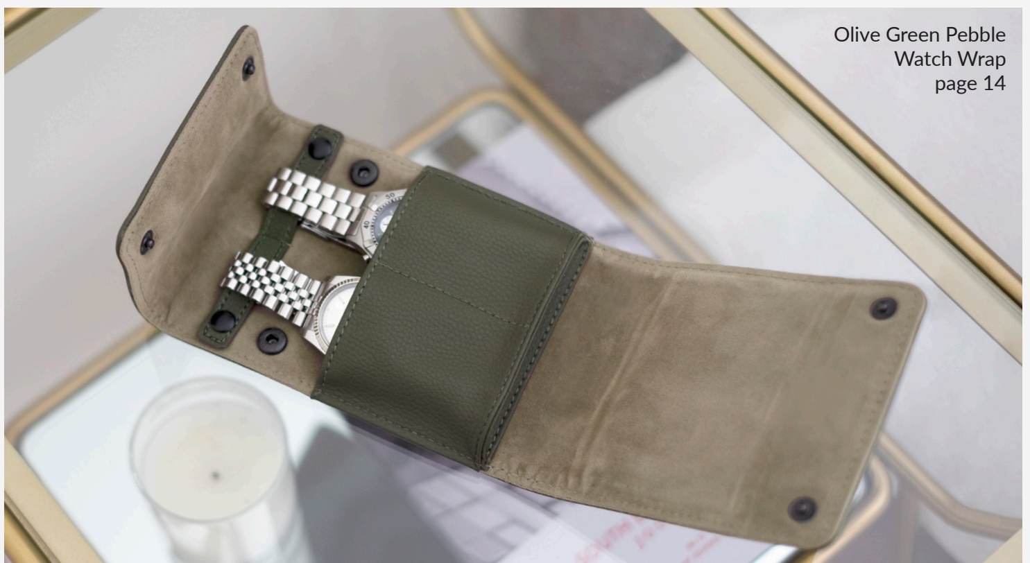
Olive Green Pebble Watch Wrap page 14