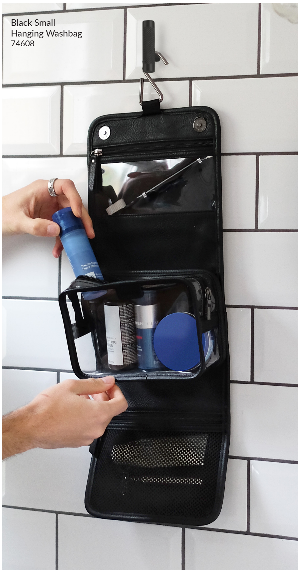
Black Small Hanging Washbag 74608