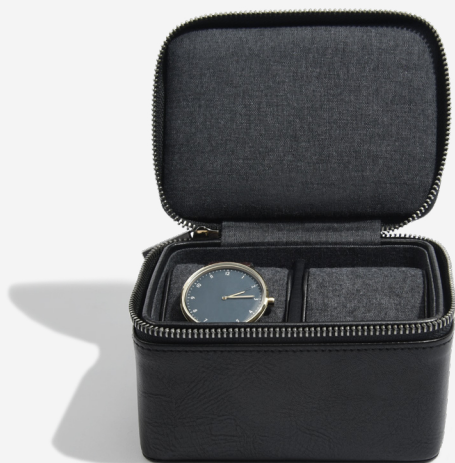
Black Large Travel Watch Box 14 x 10 x 8.5cm 75397