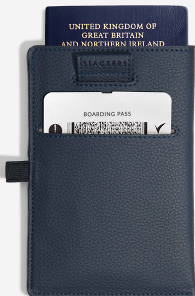
Navy Blue Pebble Passport Sleeve 10 x 15.5 x 0.8cm 74563