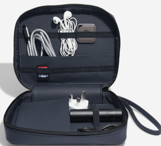
Navy Blue Pebble Cable Tidy 15 x 20 x 6cm 74564