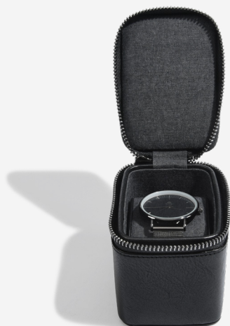
Black Small Travel Watch Box 7 x 10 x 8.5cm 75395

Keep your watch collection organised and safe with one of our travel watch boxes. With a vegan leather exterior and soft cotton lining, it is ideal for keeping your watches scratch and dust free. Easily accessible and secured with a zipped closure.