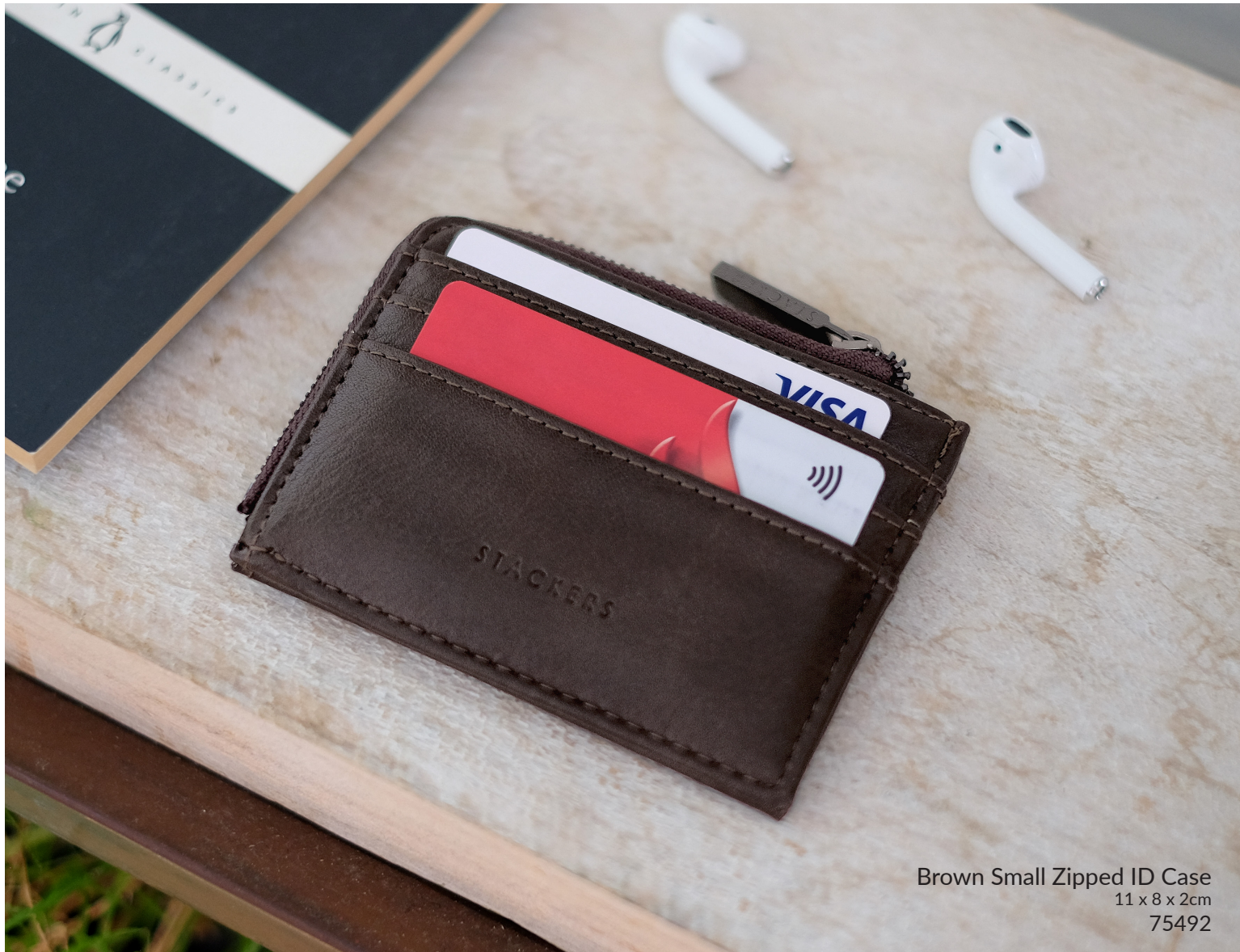
Brown Small Zipped ID Case 11 x 8 x 2cm 75492