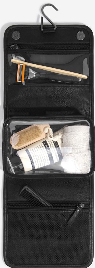
Black Small Hanging Washbag 55.5 x 20.5 x 8cm (open) 18 x 20.5 x 8cm (closed) 74608

Perfect for a weekend getaway or an overnight stay. The Stackers Small Hanging Wash Bag is a compact design making traveling practical, featuring two internal zipped pockets and a clear removable toiletry bag. It can be folded making packing easy and finished with a hanging hook for easy access.