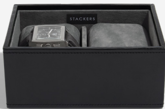
Watch Layer 12.5 x 18 x 8cm 73186