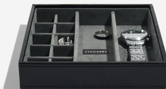
Square Cufflink Layer 19.5 x 19.5 x 4cm 73205