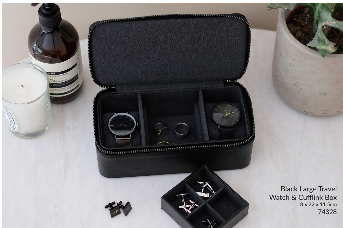
Black Large Travel Watch & Cufflink Box 8 x 22 x 11.5cm 74328