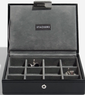
Cufflink Box 12.5 x 18 x 4.5cm 73184