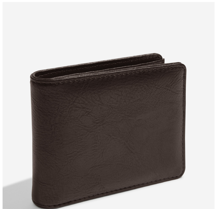
Brown Wallet 11.5 x 9.5 x 1.5cm 75402