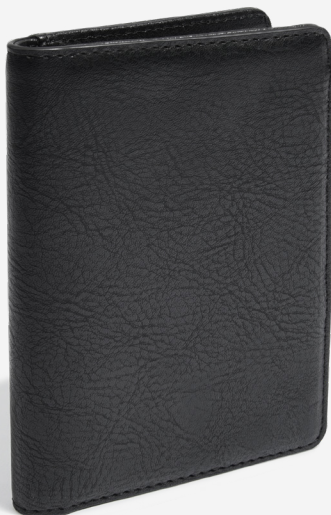
Black Passport Holder 10 x 14 x 1.5cm 75417