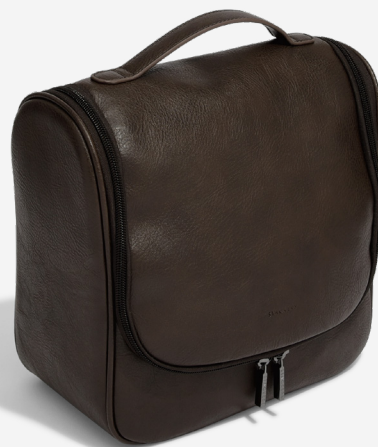
Brown Hanging Washbag 26 x 14 x 27cm 74333