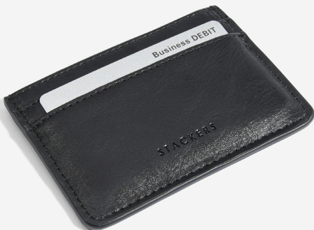
Black Card Case 10.5 x 7.5 x 0.5cm 75405