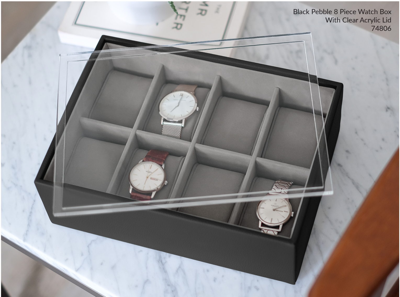
Black Pebble 8 Piece Watch Box With Clear Acrylic Lid 74806