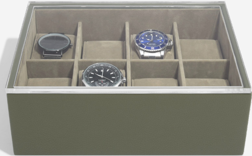
Olive Green Pebble 8 Piece Watch Box Set With Clear Acrylic Lid