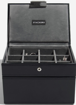
Cufflink & Watch Box (Contains 73184, & 73186) 12.5 x 18 x 12cm 73187