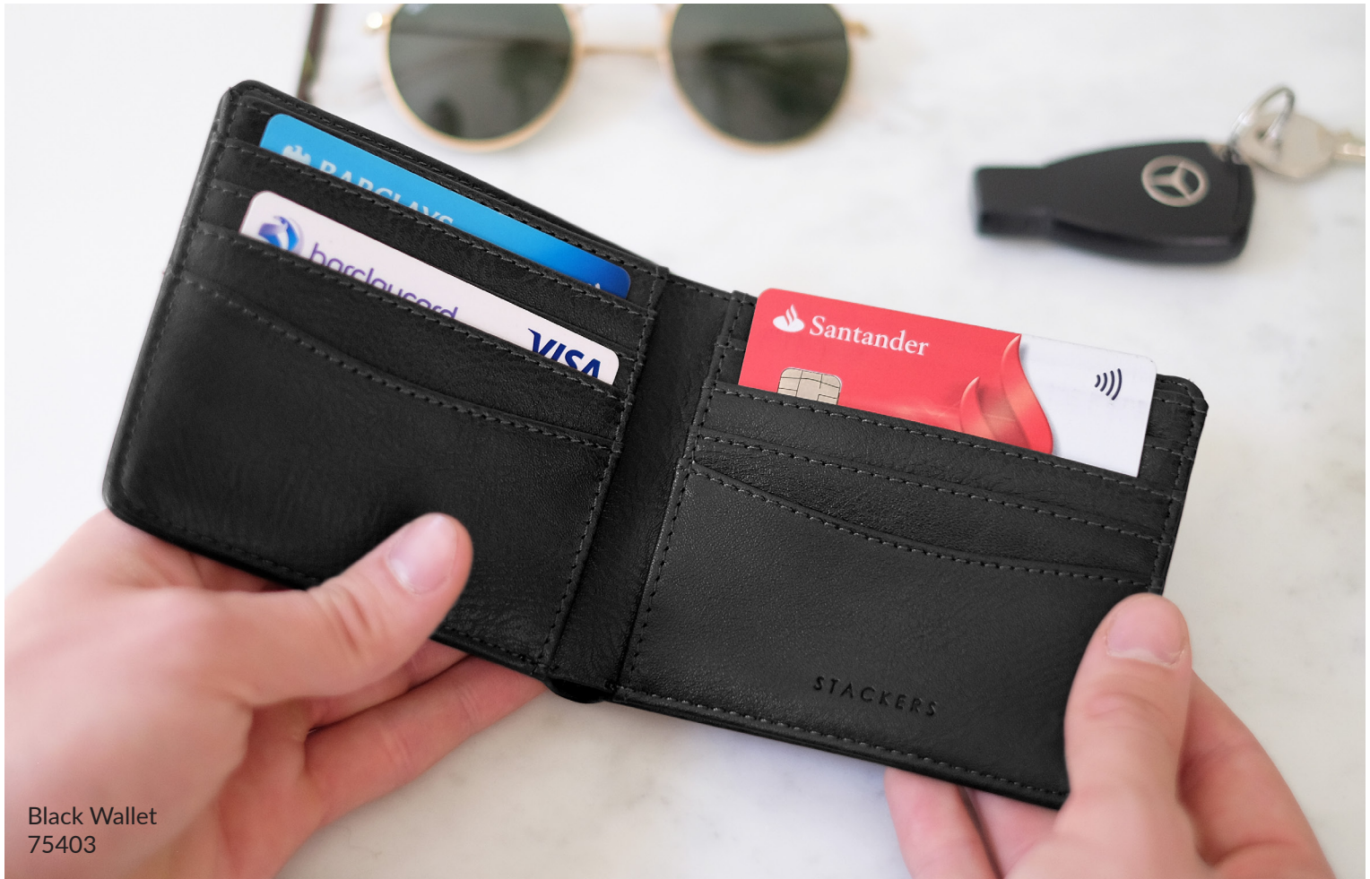
Black Wallet 75403

Keeping all your important belongings secure and in one place, this soft vegan leather wallet features 8 card slots, 2 large hidden pockets, as well as a full-length note pocket.