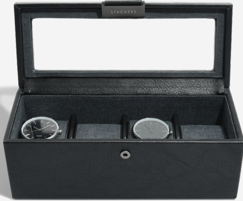
Black 4 Piece Watch Box 9.5 x 24 x 9.5cm 75399

Keep your watch collection organised and safe with one of our watch boxes. With a vegan leather exterior and quality cotton lining, it will keep your pieces scratch and dust free.