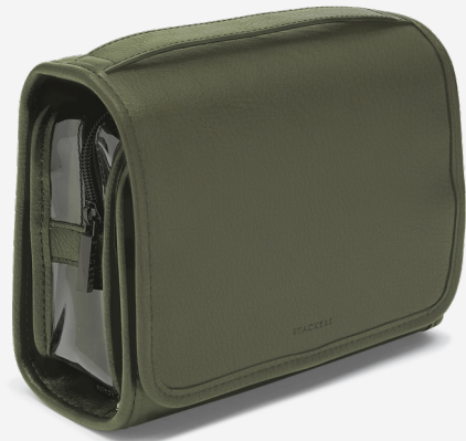
Olive Green Pebble Small Hanging Washbag 55.5 x 20.5 x 8cm (open) 18 x 20.5 x 8cm (closed) 74576