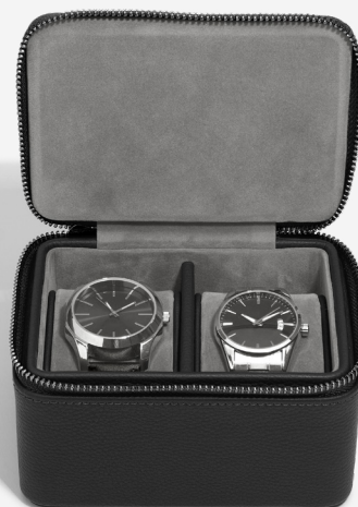
Black Pebble Large Travel Watch Box 14 x 10 x 8.5cm 74801