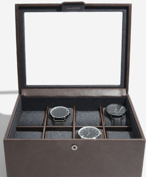
Brown 8 Piece Watch Box 19.5 x 24 x 9.5cm 75400