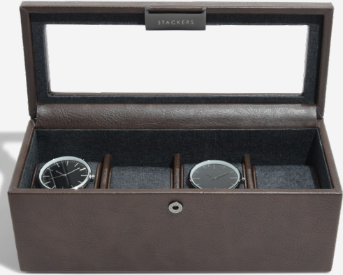
Brown 4 Piece Watch Box 9.5 x 24 x 9.5cm 75398