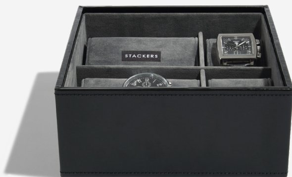
Square Watch Layer 19.5 x 19.5 x 8.5cm 73206