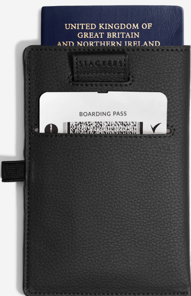
Black Pebble Passport Sleeve 10 x 15.5 x 0.8cm 74800