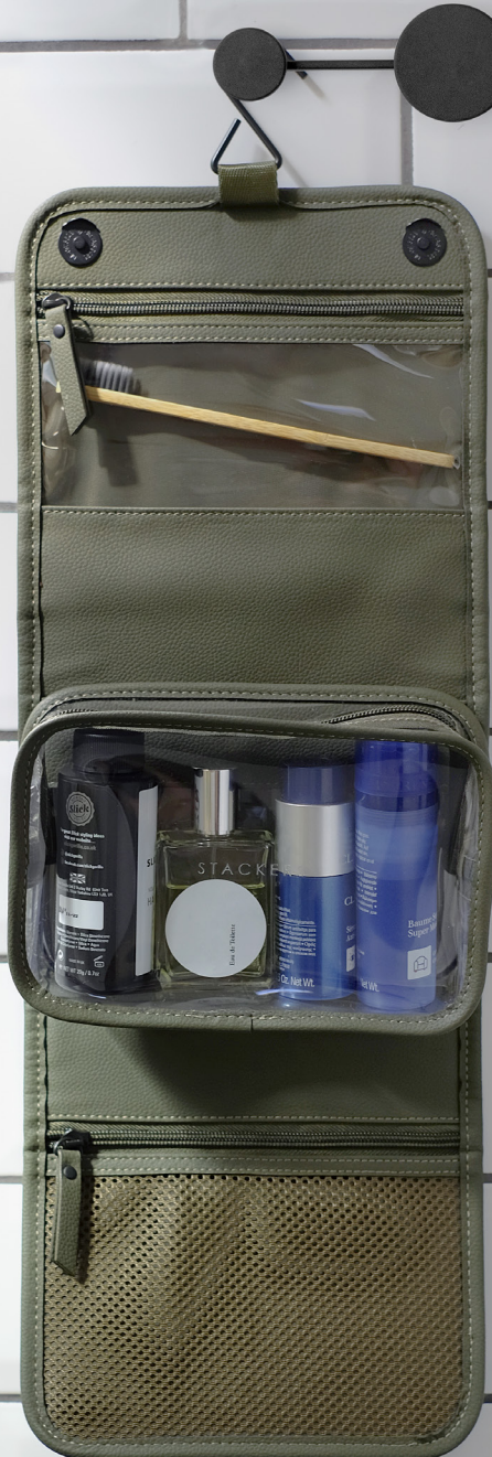
Olive Green Pebble Small Hanging Washbag 74576