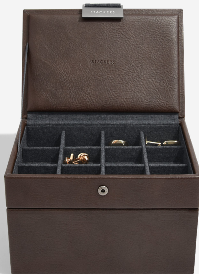
Brown Mini Watch & Cufflink Box 12 x 12.5 x 18cm 74322