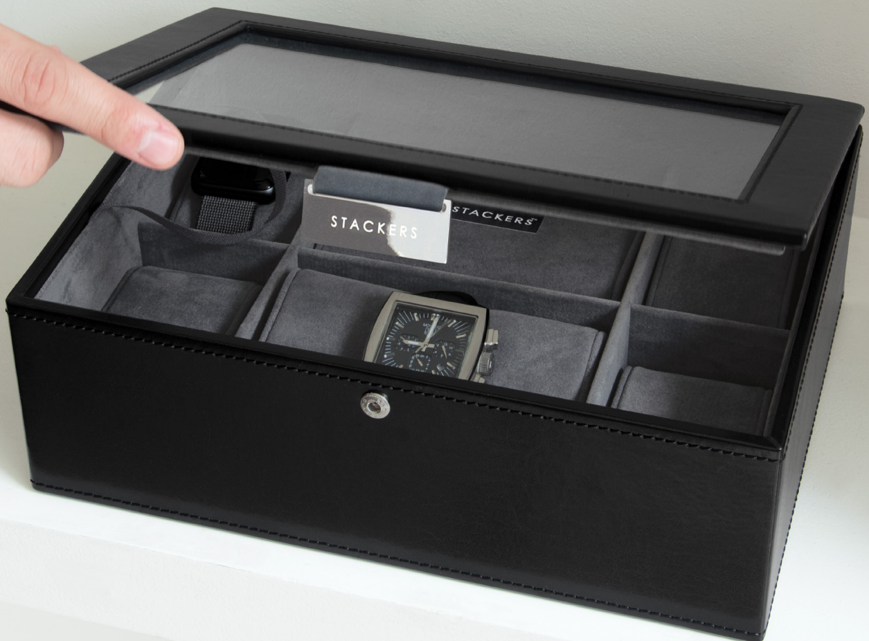
8 Piece Watch Box 73223