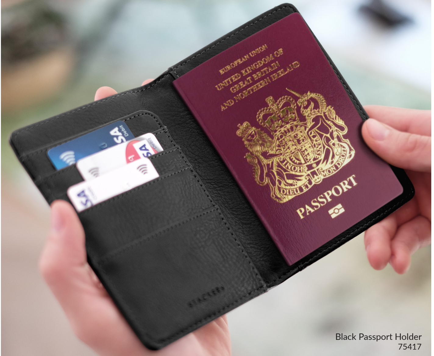
Black Passport Holder 75417

This classic passport cover is practical yet stylish. Featuring plenty of card slots, and larger pockets to house your passport and travel documents, it's your ideal travel companion.