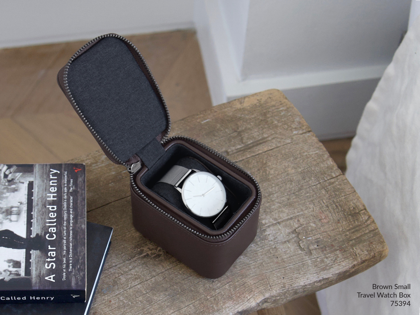
Brown Small Travel Watch Box 75394

Keep your watch collection organised and safe with one of our travel watch boxes. With a vegan leather exterior and soft cotton lining, it is ideal for keeping your watches scratch and dust free. Easily accessible and secured with a zipped closure.