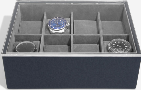
Navy Blue Pebble 8 Piece Watch Box With Clear Acrylic Lid