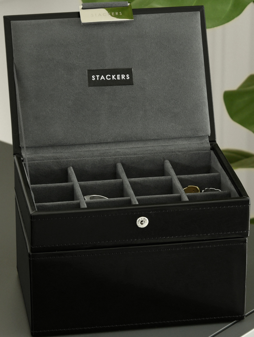
Cufflink & Watch Box 73187