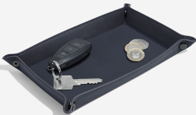
Navy Blue Pebble Travel Catchall 31.5 x 10 x 4.5cm 74568