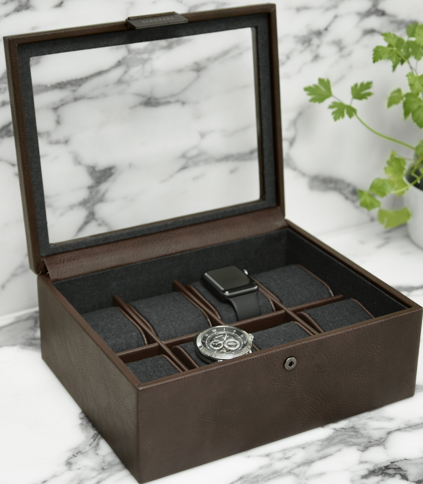
Brown 8 Piece Watch Box 75400