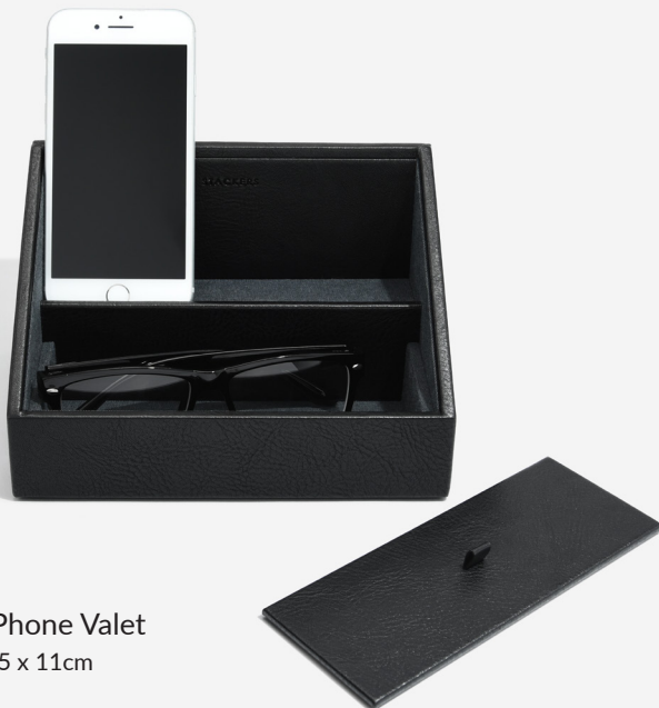
Black Phone Valet 18 x 12.5 x 11cm 75425