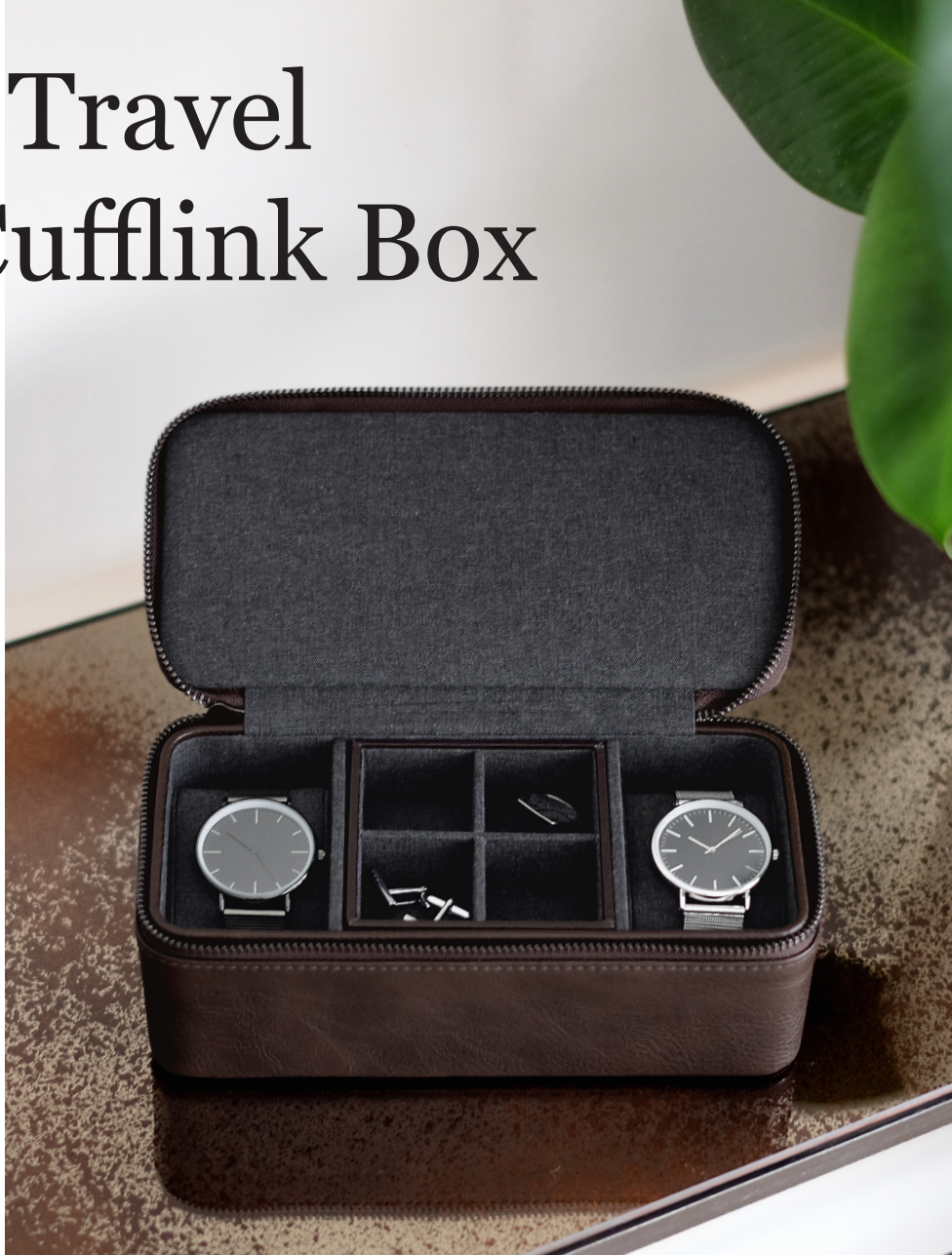
Brown Large Travel Watch & Cufflink Box 8 x 22 x 11.5cm 74330

The ultimate travel companion whether it's for business or pleasure. The Zipped Watch and Cufflink Box features 2 watch pads and a cufflink tray that can lift out to uncover a useful hidden compartment, making it ideal for work trips or holidays.