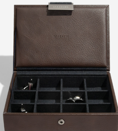
Brown Lidded Mini Cufflink Box 13.5 x 18 x 4.5cm 75422