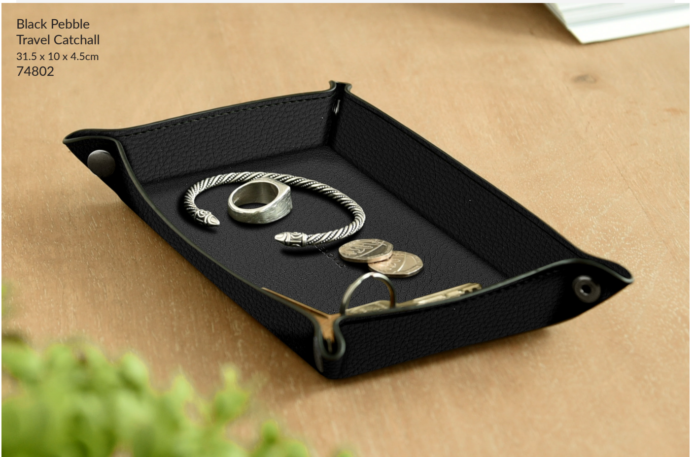
Black Pebble Travel Catchall 31.5 x 10 x 4.5cm 74802

Transform your bedside table with this stylish soft vegan leather catchall, ideal for housing loose change and any odd bits that are left in your pockets at the end of the day. Also great for travel, popper closures allow the catchall to flatten and fit in your suitcase.