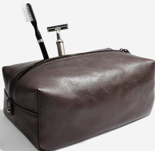
Brown Washbag 26 x 16.5 x 12cm 75412

This soft vegan leather toiletry bag is the ideal companion whether you're traveling the world or planning a weekend city break. Featuring a large space for your all essentials and an easy pull zip closure.