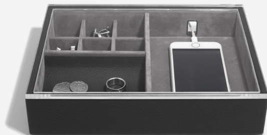
Black Pebble Valet With Clear Acrylic Lid 18 x 25 x 9.5cm 74807