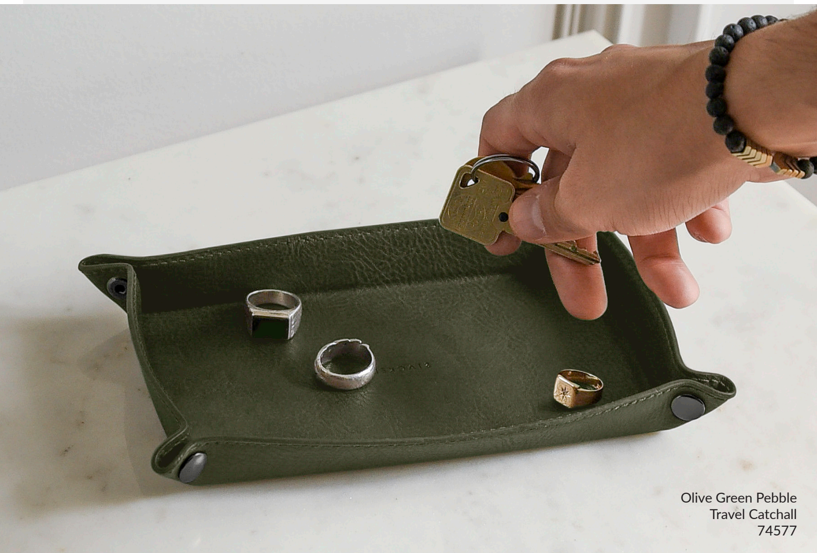
Olive Green Pebble Travel Catchall 74577