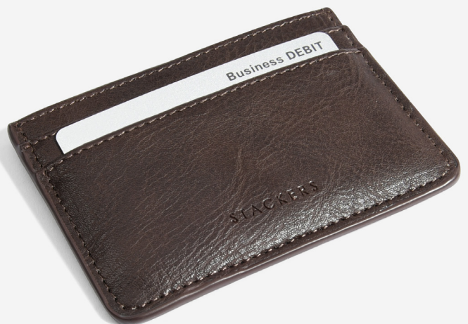
Brown Card Case 10.5 x 7.5 x 0.5cm 75404