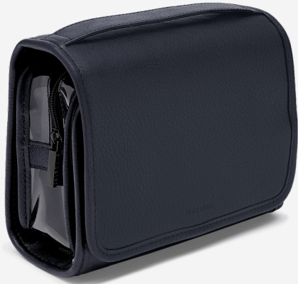
Navy Blue Pebble Small Hanging Washbag 55.5 x 20.5 x 8cm (open) 18 x 20.5 x 8cm (closed) 74567