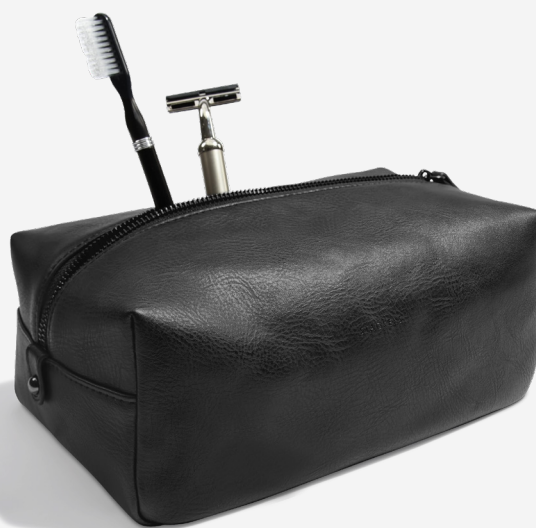
Black Washbag 26 x 16.5 x 12cm 75413