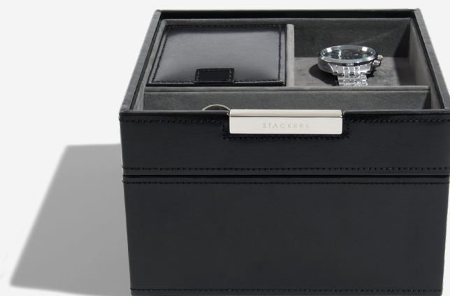
Square Valet & Watch Box (Contains 73204, & 73206) 19.5 x 19.5 x 12.5cm 73207