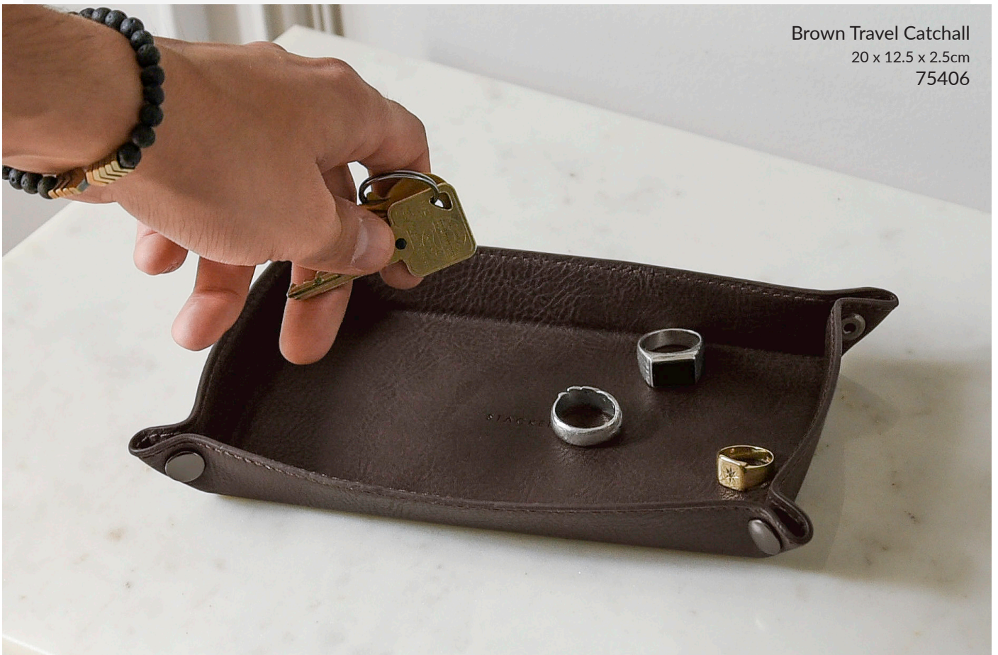
Brown Travel Catchall 20 x 12.5 x 2.5cm 75406

Transform your bedside table with this stylish soft vegan leather catchall, ideal for housing loose change and any odd bits that are left in your pockets at the end of the day. Also great for travel, popper closures allow the catchall to flatten and fit in your suitcase.