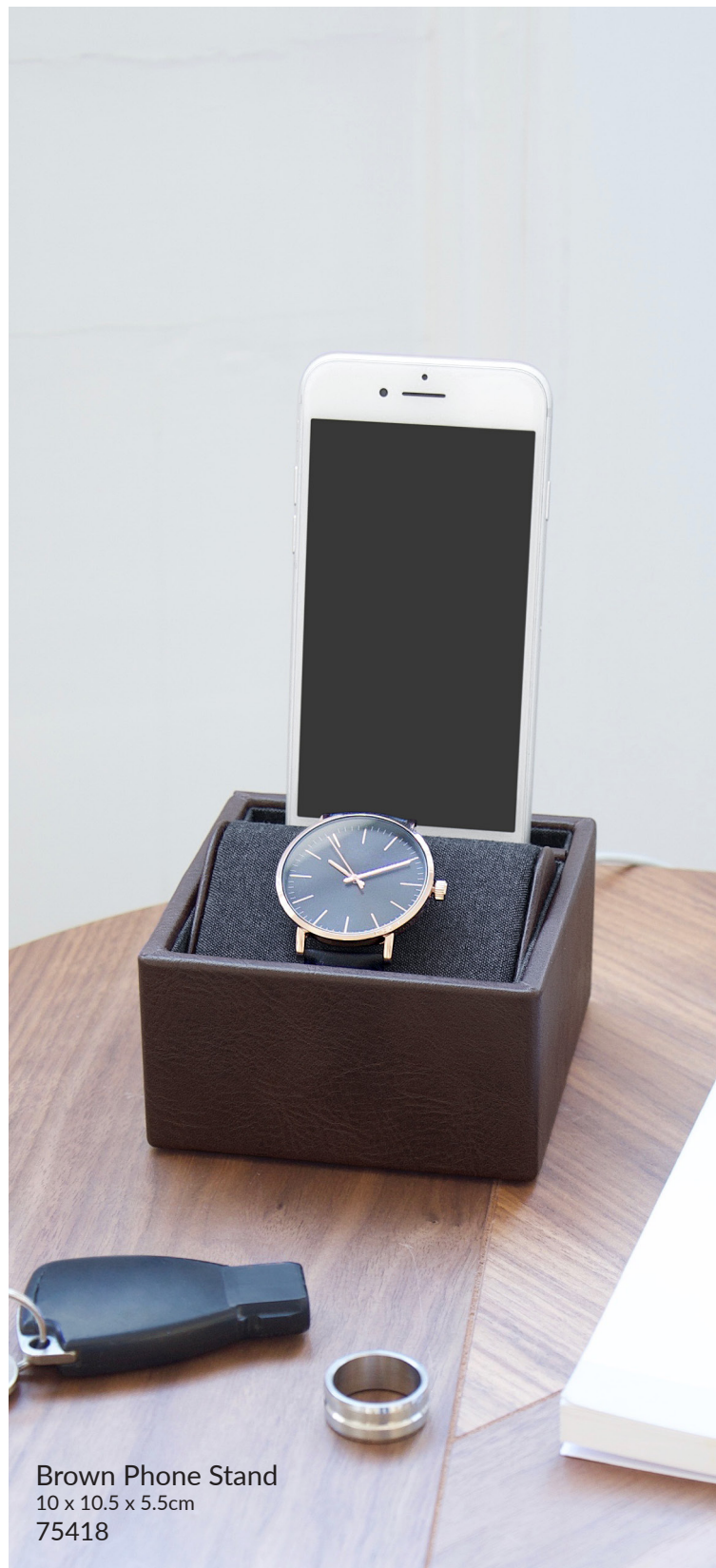
Brown Phone Stand 10 x 10.5 x 5.5cm 75418