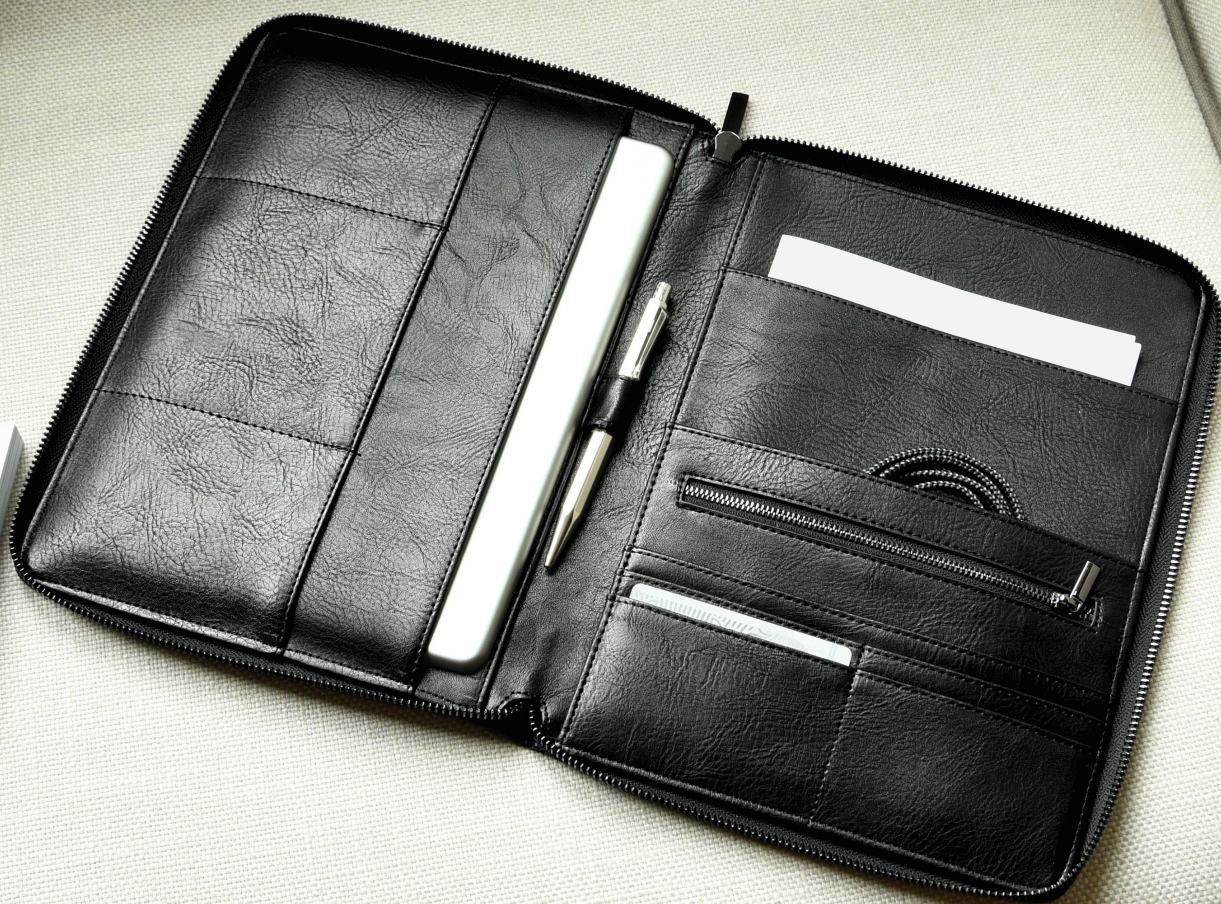
Black Tech Portfolio 21.5 x 28.5 x 2cm 75411