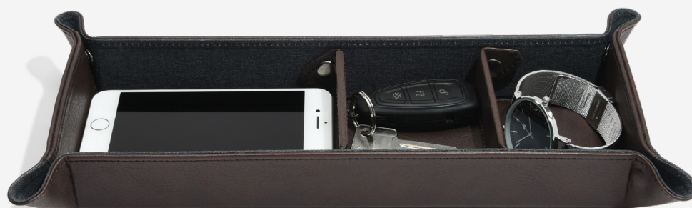
Brown Large Catchall 31.5 x 10 x 4.5cm 75408