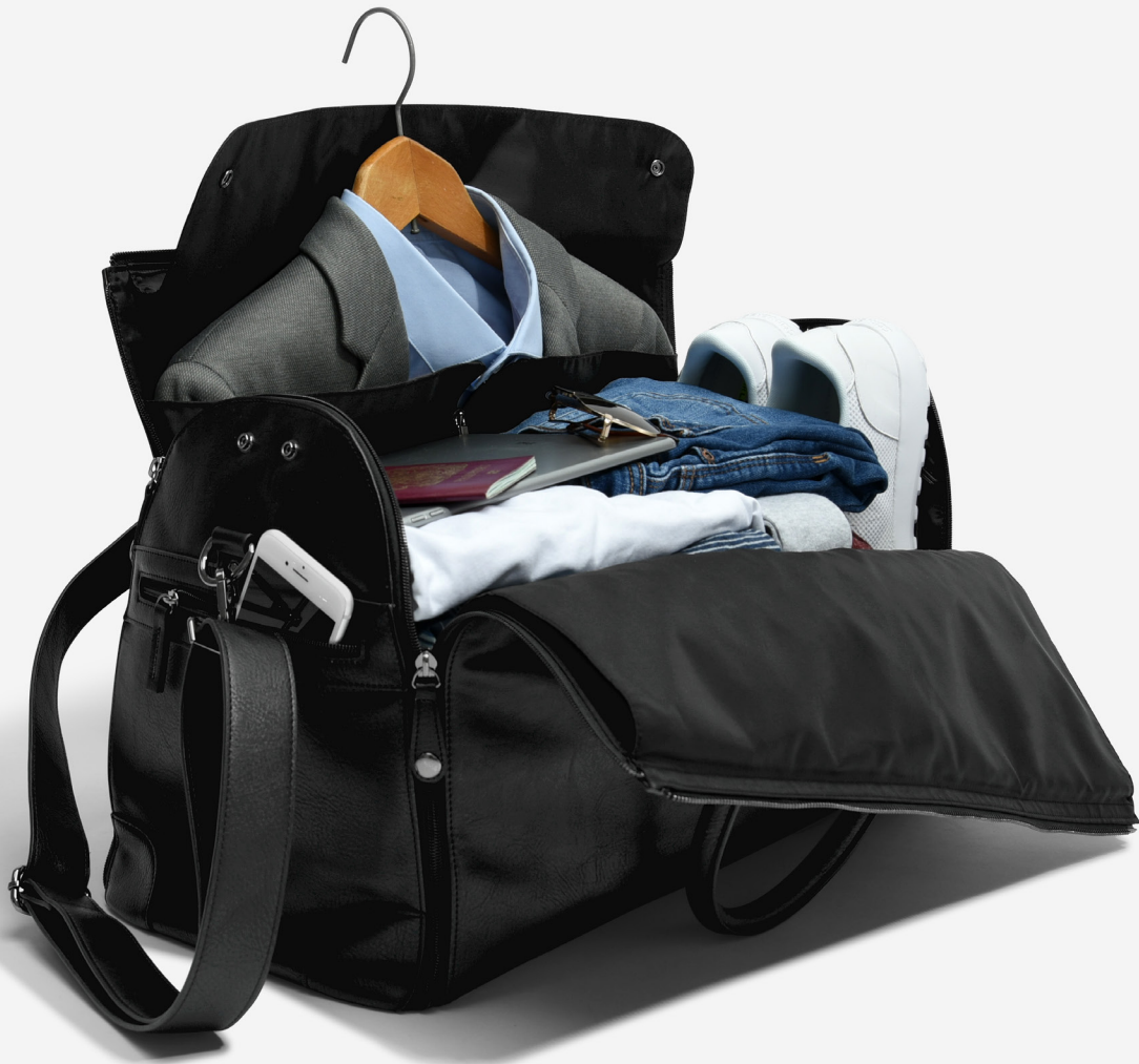
Black Weekend Suit Bag 26 x 30 x 55cm 74432