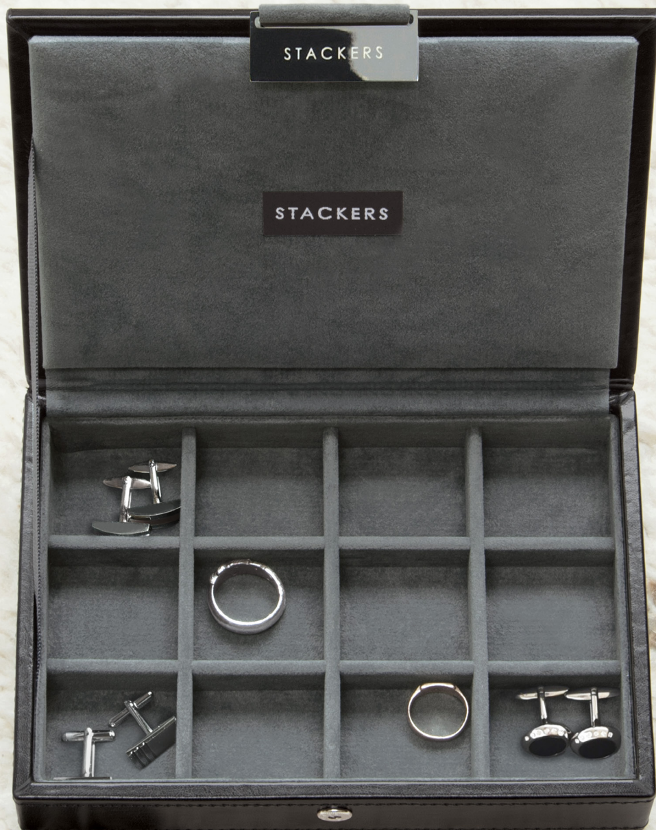
Cufflink Box 73184

Soft black faux leather exterior with a soft grey velvet lining. An extensive stylish collection of watch and cufflink boxes designed to keep mens accessories safe and organised.