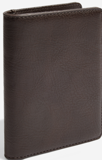
Black Passport Holder 10 x 14 x 1.5cm 75416