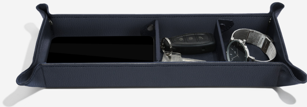
Navy Blue Pebble Large Catchall 31.5 x 10 x 4.5cm 74562