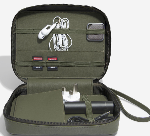
Olive Green Pebble Cable Tidy 15 x 20 x 6cm 74574