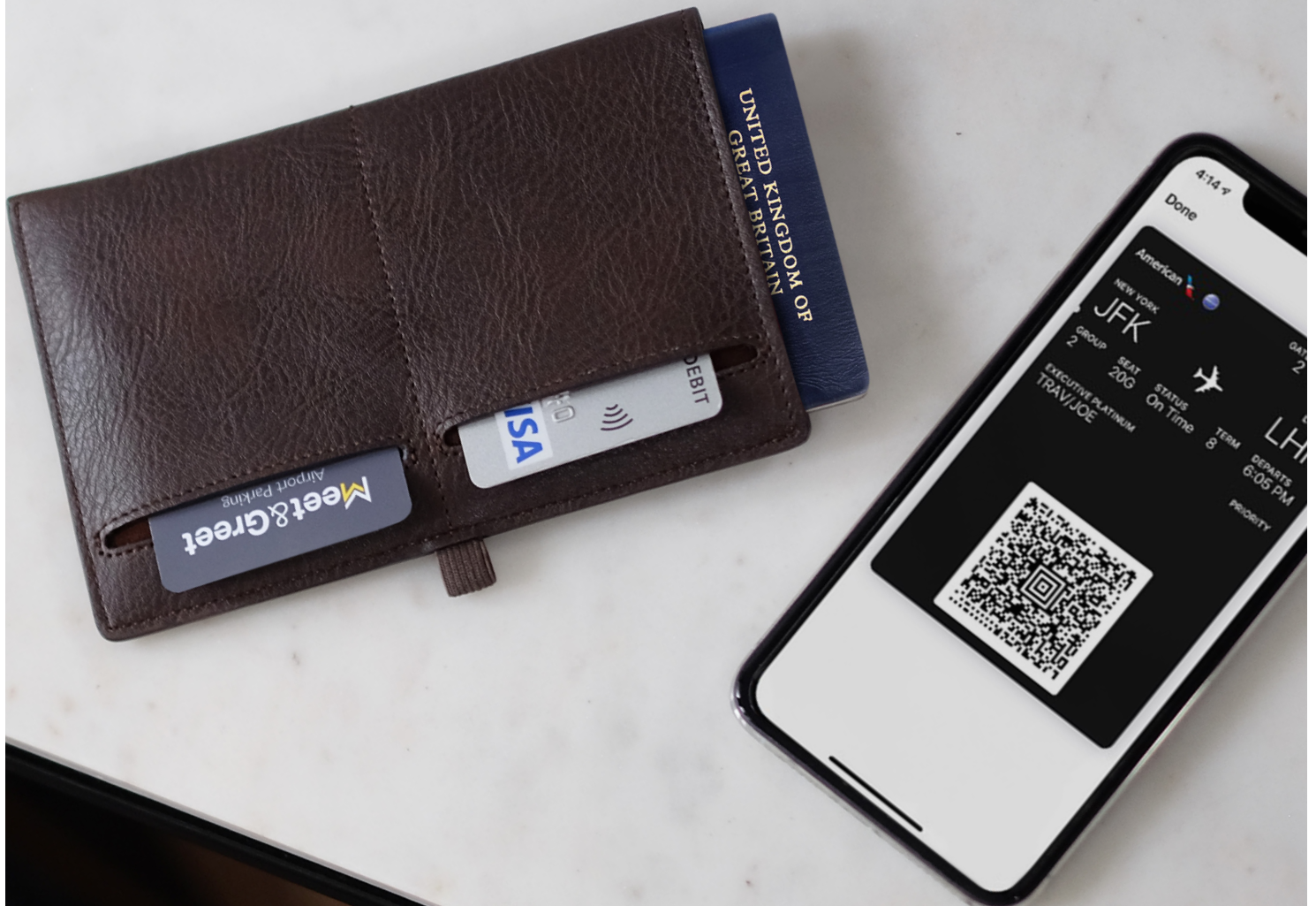
Brown Passport Sleeve 74326