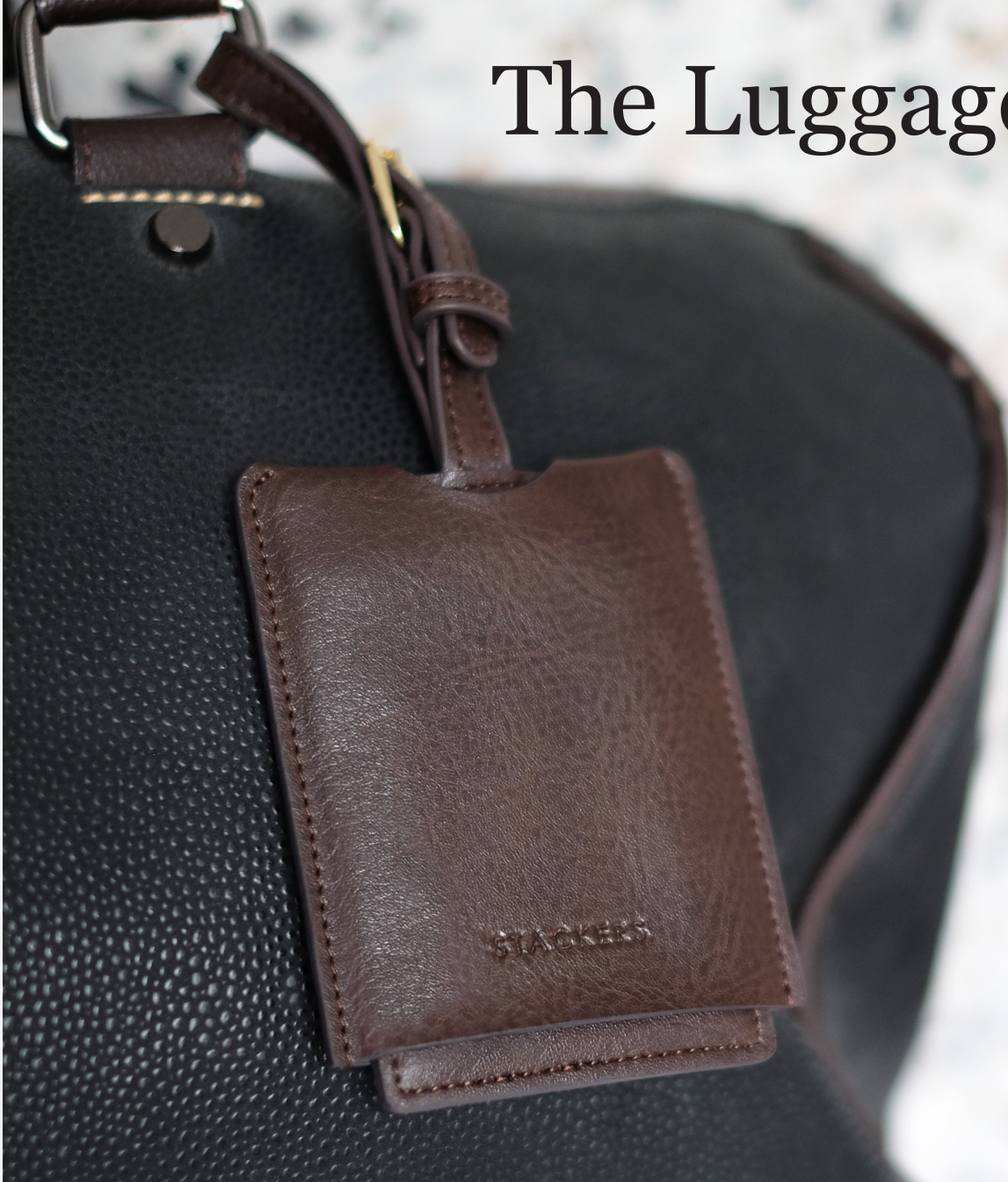
Brown Luggage Tag 19.5 x 8 x 1cm 74324