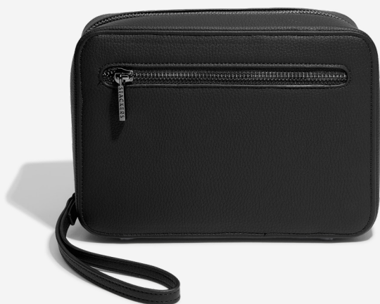
Black Pebble Cable Tidy 15 x 20 x 6cm 74804

We know organising your tech accessory essentials can be problematic, that's why we designed the Stackers cable tidy case. It is designed to keep your life organised and tangle free.