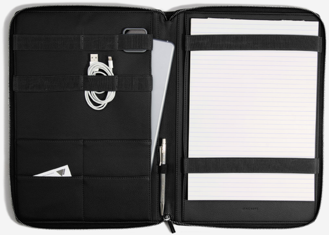
Black Pebble A4 Documents Folder 10 x 15.5 x 0.8cm 74808

This classic passport cover is practical yet stylish. Featuring plenty of card slots, and larger pockets to house your passport and travel documents, it's your ideal travel companion.