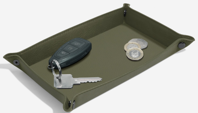
Olive Green Pebble Travel Catchall 31.5 x 10 x 4.5cm 74577