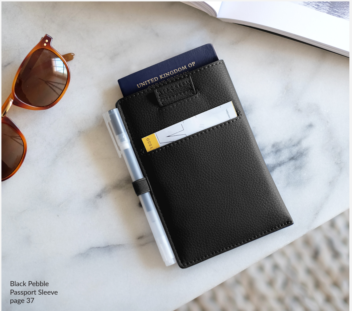
Black Pebble Passport Sleeve page 37