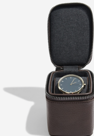
Brown Small Travel Watch Box 7 x 10 x 8.5cm 75394