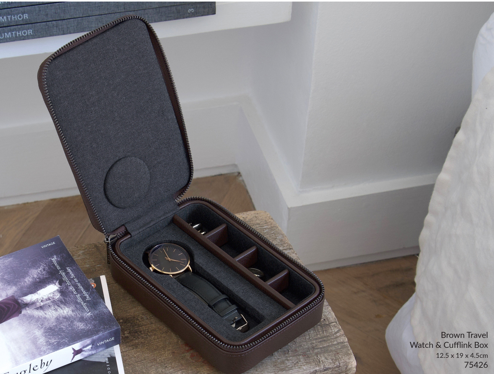
Brown Travel Watch & Cufflink Box 12.5 x 19 x 4.5cm 75426