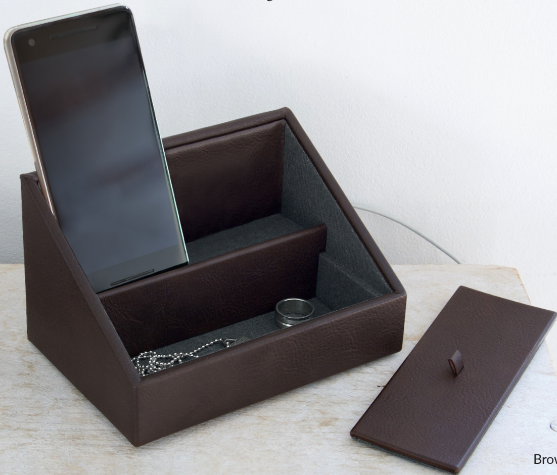
Brown Phone Valet 75424

Designed for your phone or tablet as well as keeping those daily accessories organised. Feed your cable through the back to easily charge your devices whilst keeping cables neat and out of sight.