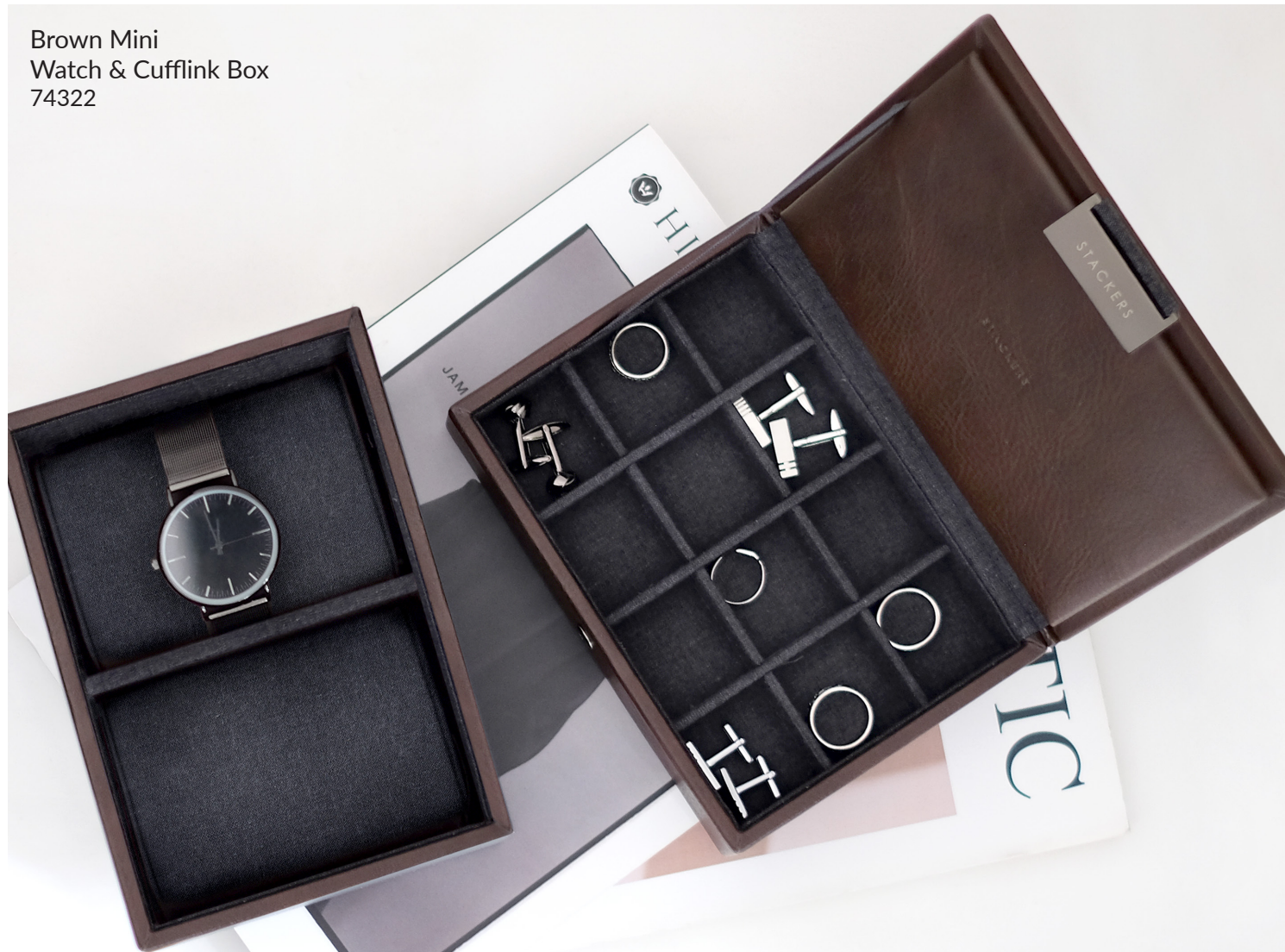
Brown Mini Watch & Cufflink Box 74322