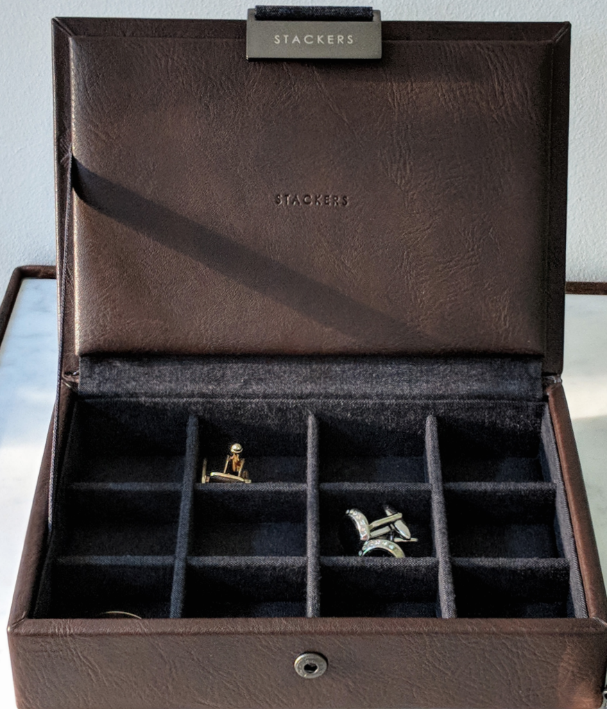
Brown Lidded Mini Cufflink Box 75422

Keep your watch collection organised and safe with one of our watch boxes. With a vegan leather exterior and quality cotton lining, it will keep your pieces scratch and dust free.