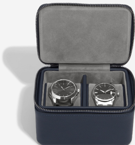
Navy Blue Pebble Large Travel Watch Box 14 x 10 x 8.5cm 74569