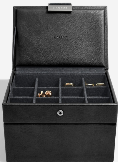
Black Mini Watch & Cufflink Box 12 x 12.5 x 18cm 74321