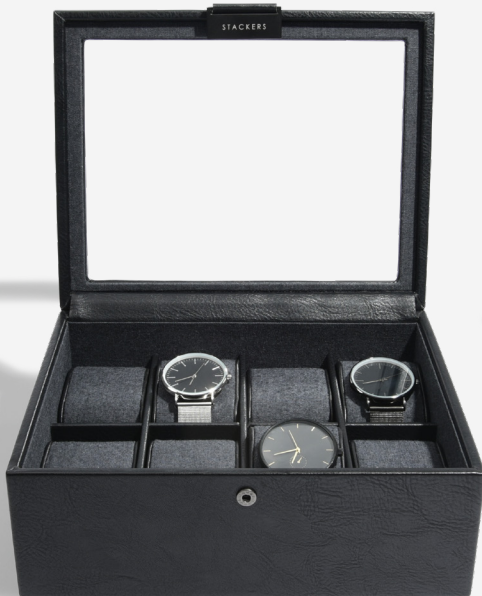
Black 8 Piece Watch Box 19.5 x 24 x 9.5cm 75401