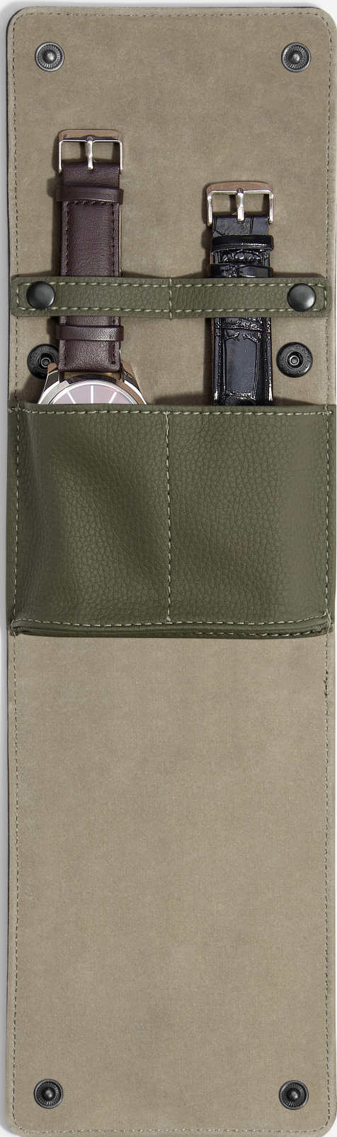
Olive Green Pebble Watch Wrap 40 x 11.5 x 4cm (open) 17 x 11.5 x 3cm (closed) 74575