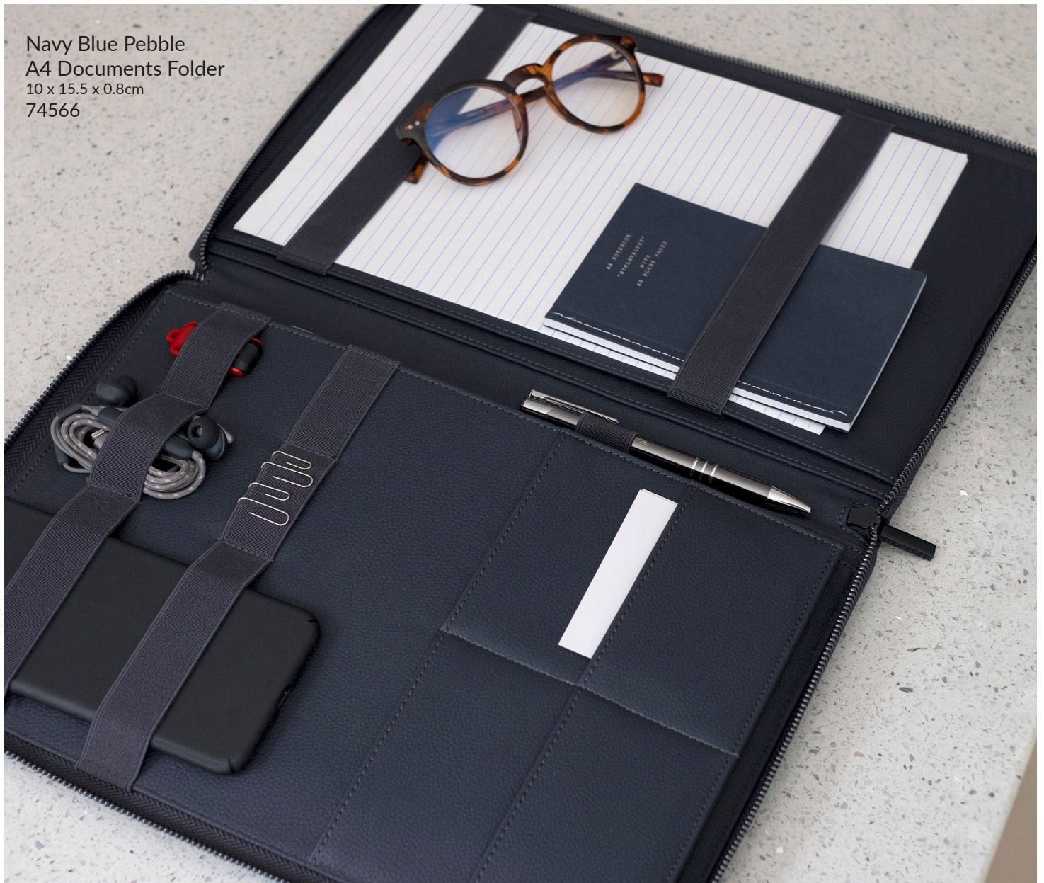
Navy Blue Pebble A4 Documents Folder 10 x 15.5 x 0.8cm 74566