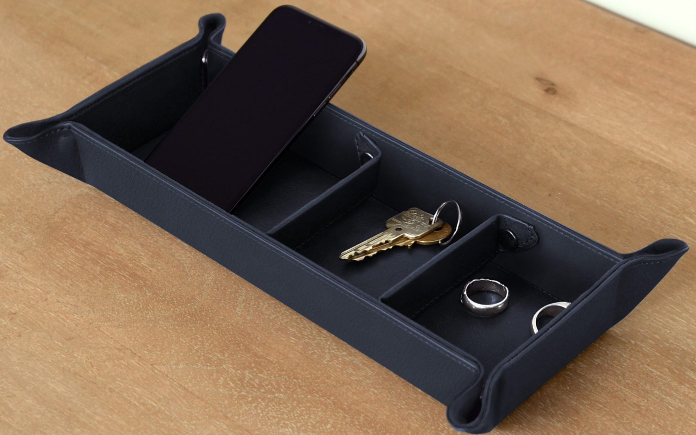
Navy Blue Pebble Large Catchall 74562