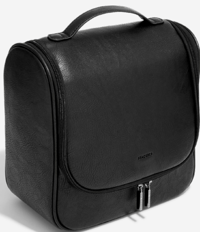
Black Hanging Washbag 26 x 14 x 27cm 74334