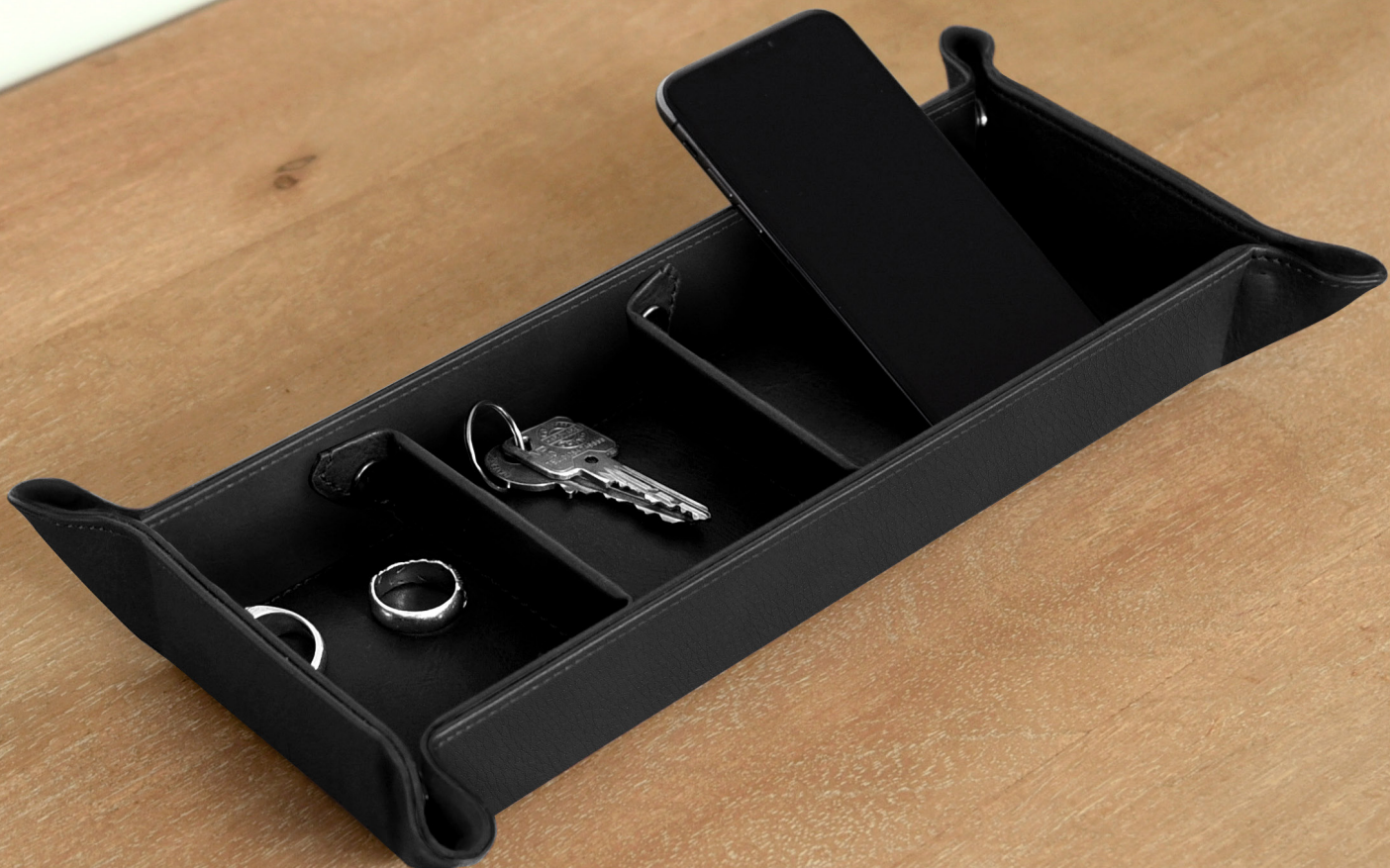
Black Large Catchall 31.5 x 10 x 4.5cm 75409