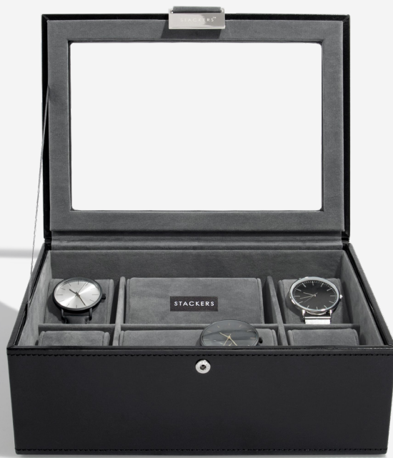
8 Piece Watch Box 19.5 x 26 x 9.5cm 73223