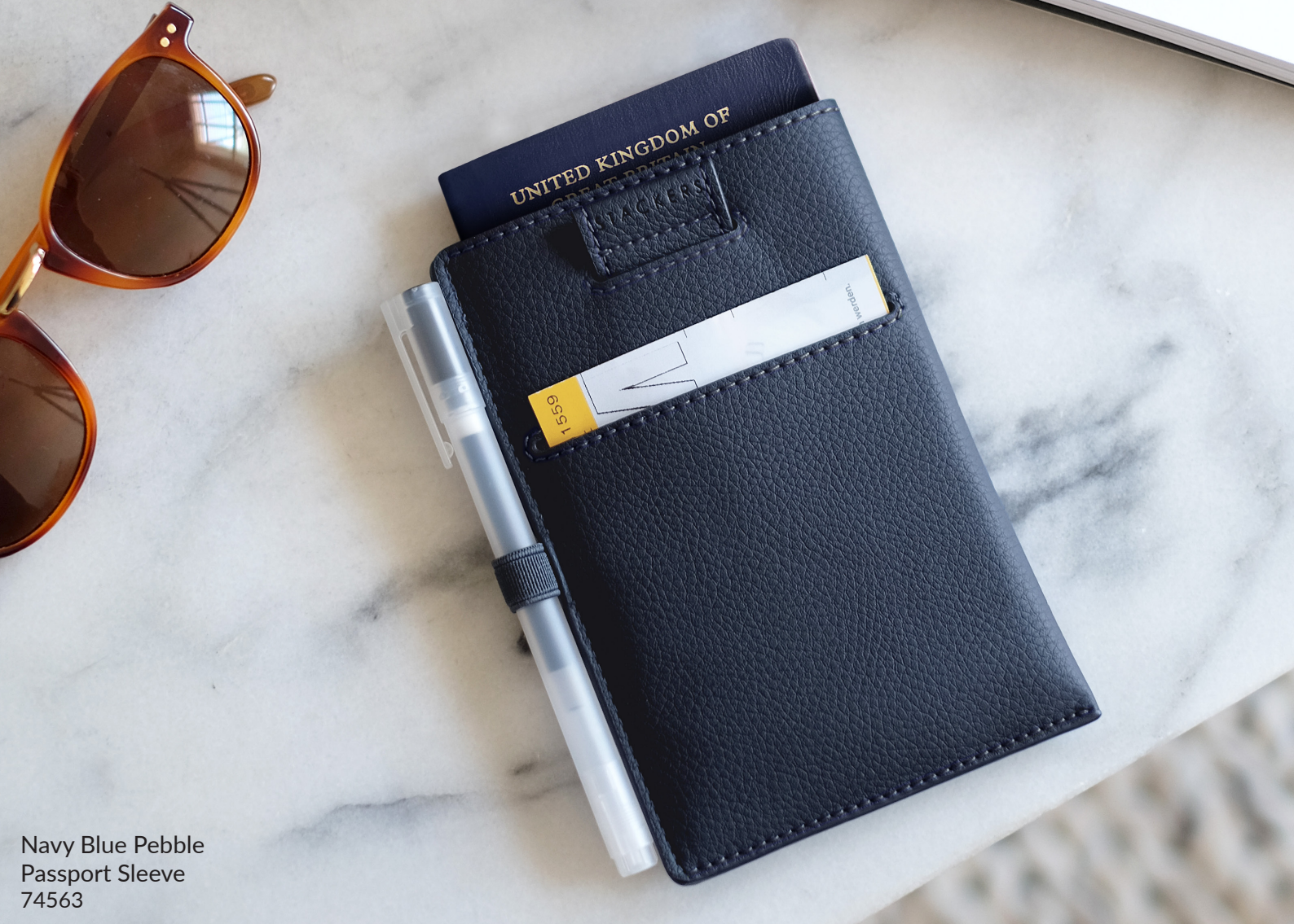
Navy Blue Pebble Passport Sleeve 74563