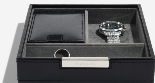
Square Valet 19.5 x 19.5 x 4cm 73204