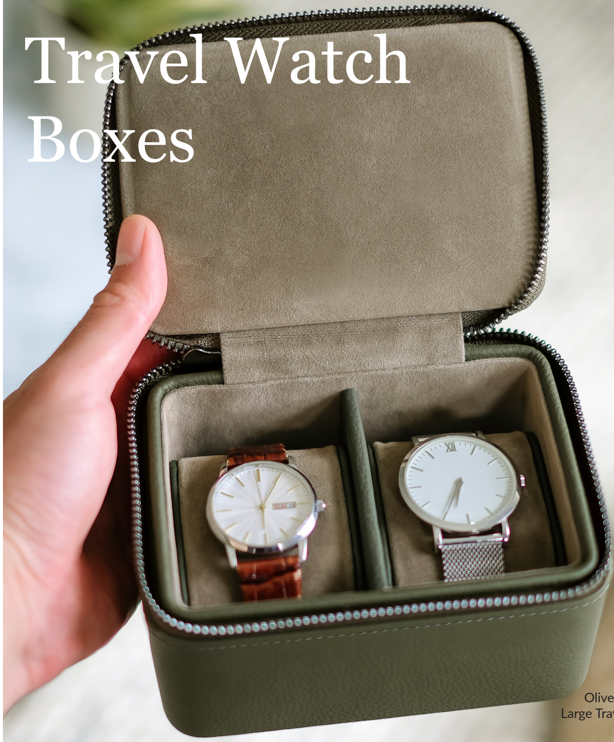
Olive Green Pebble Large Travel Watch Box 74578