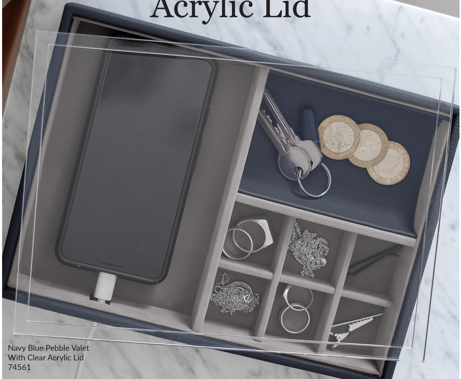
Navy Blue Pebble Valet With Clear Acrylic Lid 74561