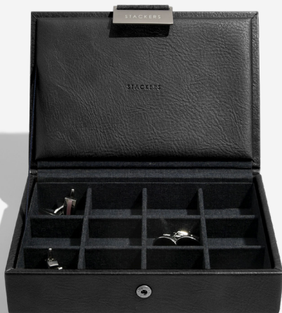
Black Lidded Mini Cufflink Box 13.5 x 18 x 4.5cm 75423