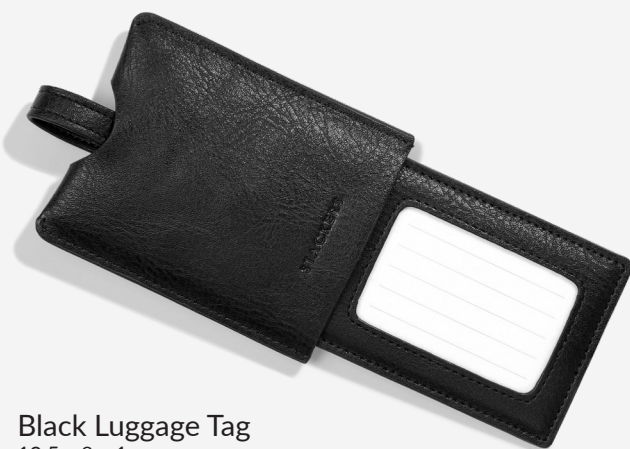
Black Luggage Tag 19.5 x 8 x 1cm 74323

Get holiday ready and keep your luggage safe and recognisable with this Stackers Luggage Tag.