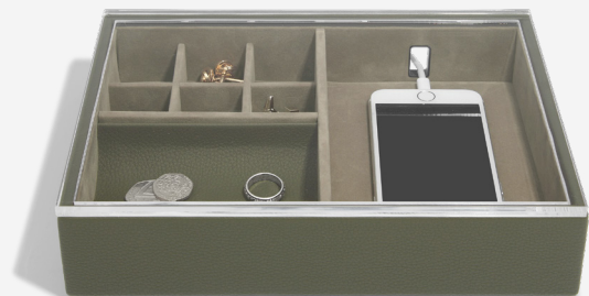
Olive Green Pebble Valet With Clear Acrylic Lid 18 x 25 x 9.5cm 74571