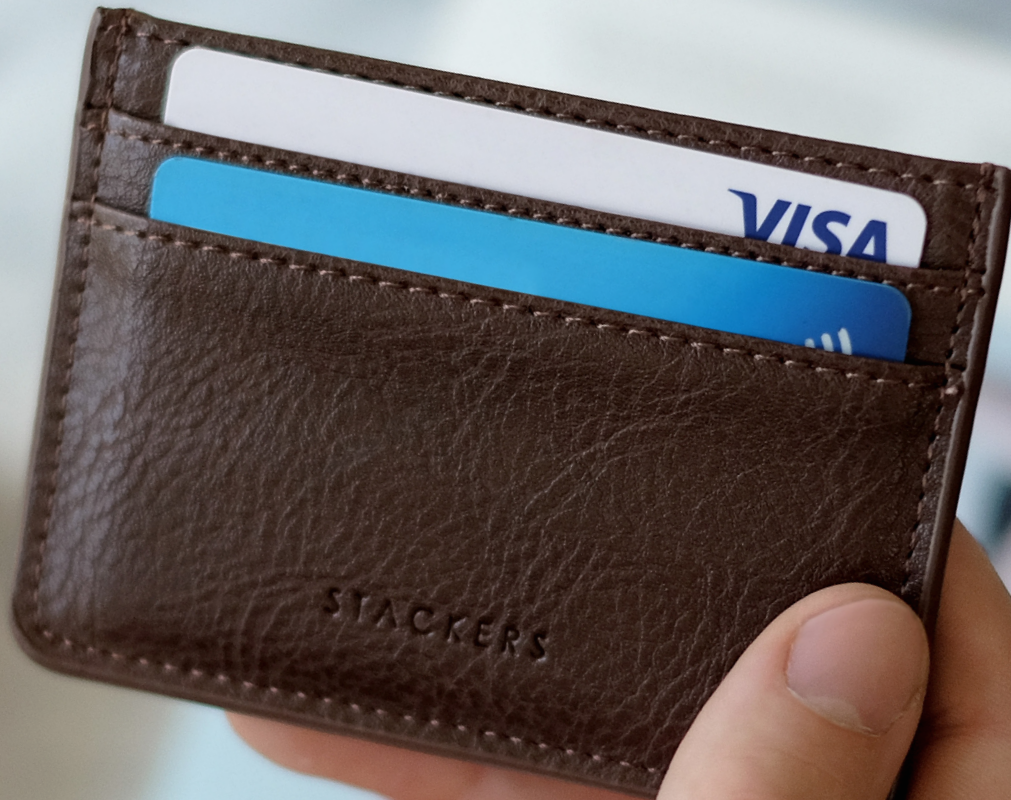
Brown Card Case 10.5 x 7.5 x 0.5cm 75404

In soft vegan leather, this small card case is perfect for those that like to travel light. With enough compartments for your essentials, it is the ideal alternative to a wallet. It hosts 4 external card slots, as well as an internal pocket and is finished with the subtle Stackers branding.