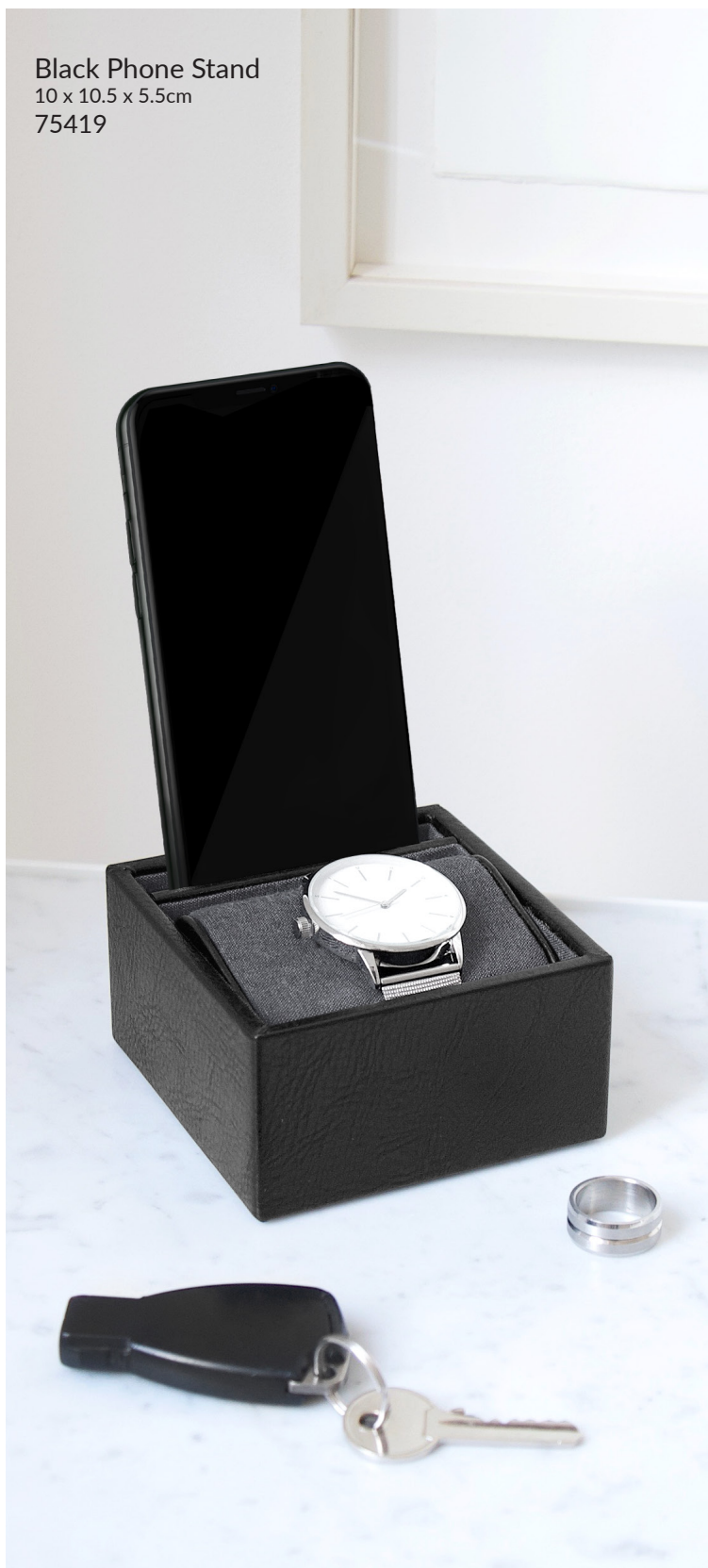
Black Phone Stand 10 x 10.5 x 5.5cm 75419

Tidy up your bedside table with the Phone Stand. The ideal home for your phone and watch at the end of the day. Feed your cable through the back to easily charge your phone whilst keeping the cable out of sight.