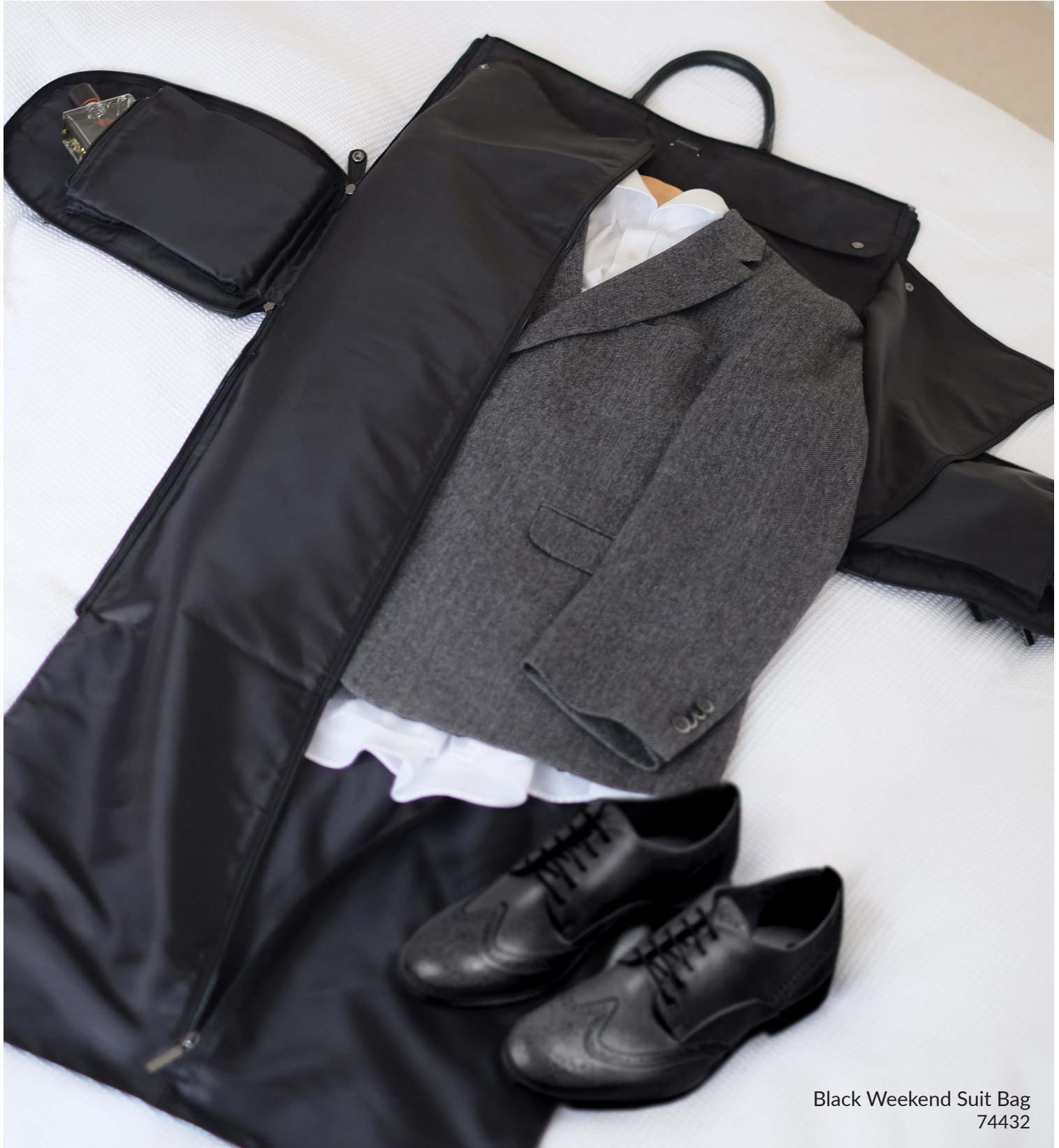
Black Weekend Suit Bag 74432

The Stackers Weekend Suit Bag has reinvented the way you travel, whether it's for business or pleasure. Ideal for weekends away, especially weddings or formal functions, this suit bag doubles as a weekend holdall once zipped up, halving the amount of luggage you need to travel with! The sides and top unzip to unveil the suit bag inside and it has space to be hung up when you reach your destination.