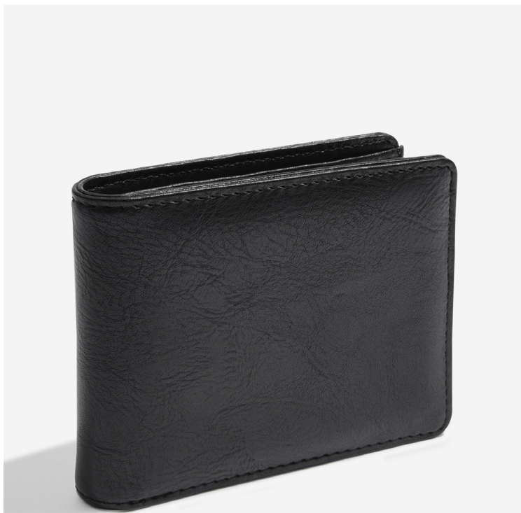
Black Wallet 11.5 x 9.5 x 1.5cm 75403