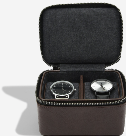
Brown Large Travel Watch Box 14 x 10 x 8.5cm 75396