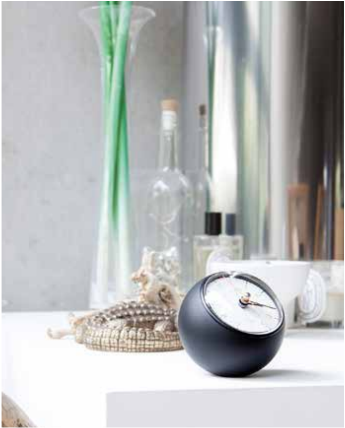
TIL19-09 EARTH CLOCK LESS • design: takenobu igarashi