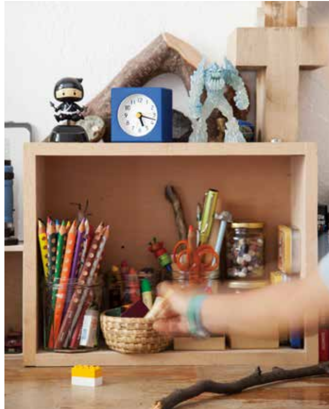
PA18-12 FARBE • design: lemnos design group