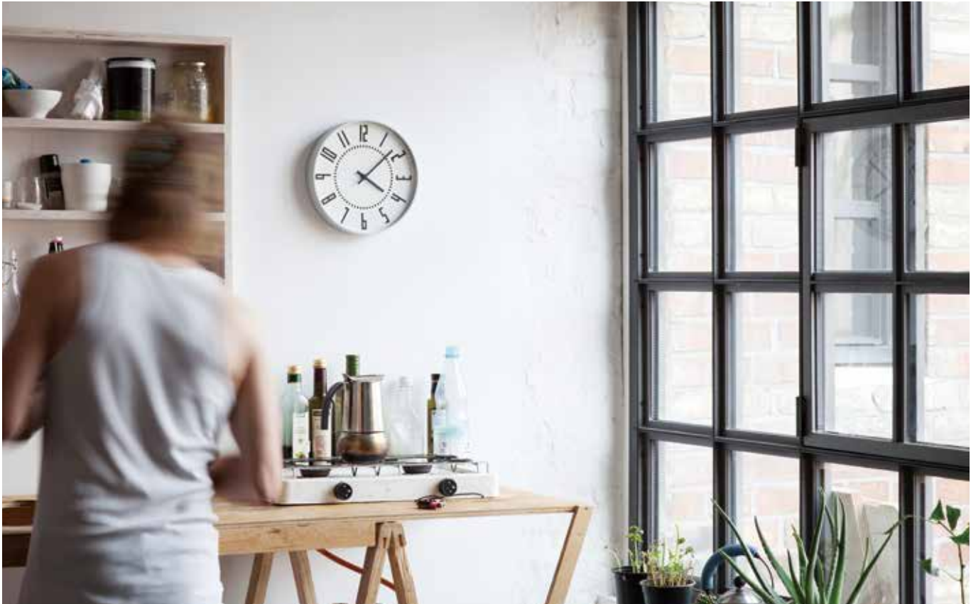
TIL16-01 EKI CLOCK • design: takenobu igarashi