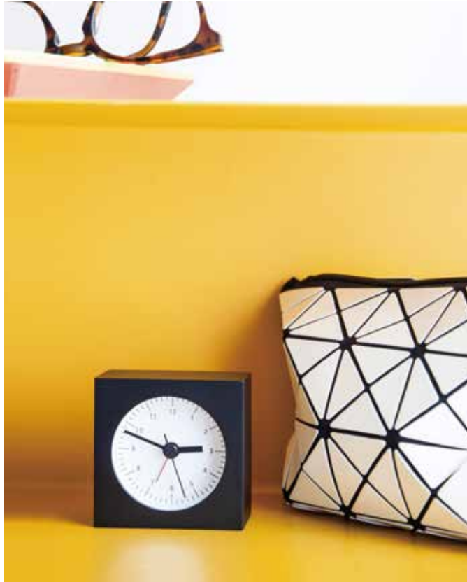
YK19-18 CITY POP ALARM • design: yota kakuda