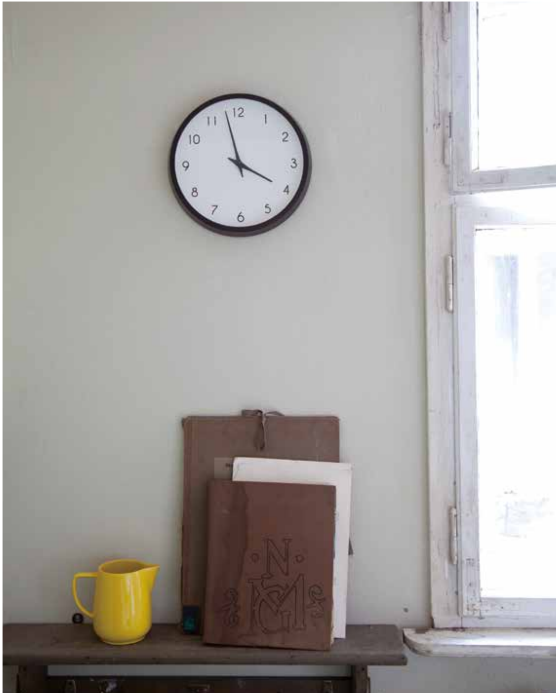
PC10-24 CAMPAGNE • design: lemmos design group