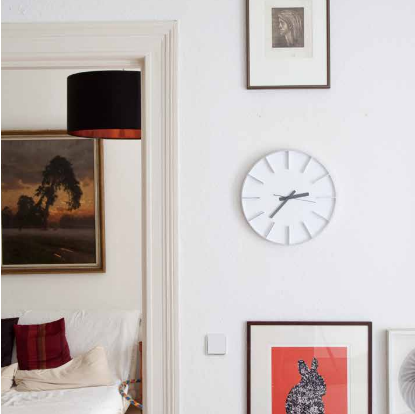
AZ-0115 EDGE CLOCK L • design: shin azumi, tomoko azumi