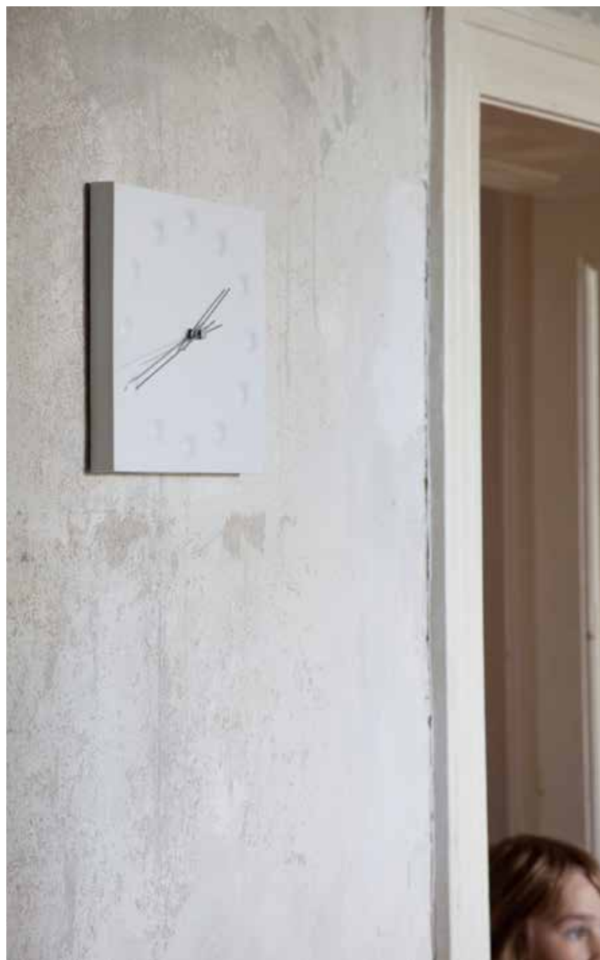
KC03-23 DROPS DRAW THE EXISTANCE • design: kanae tsukamoto