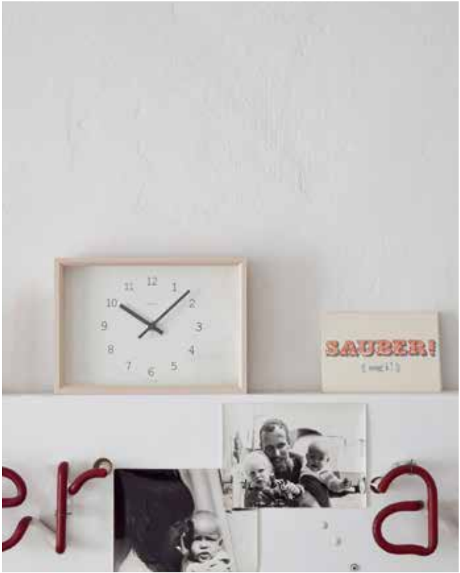
NY14-02 KAEDE • design: yuichi nara