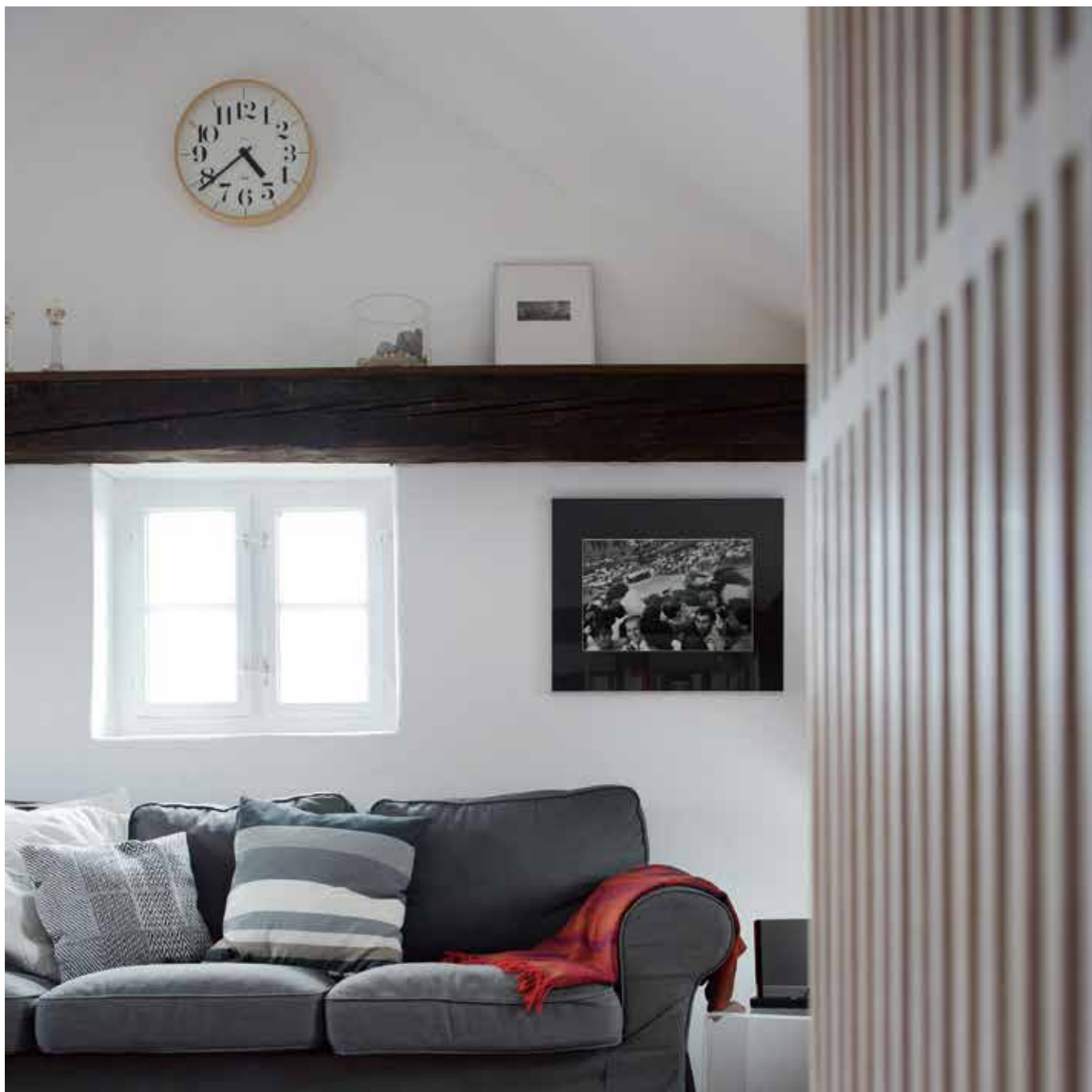
WR-0401 L RIKI CLOCK L • design: riki watanabe