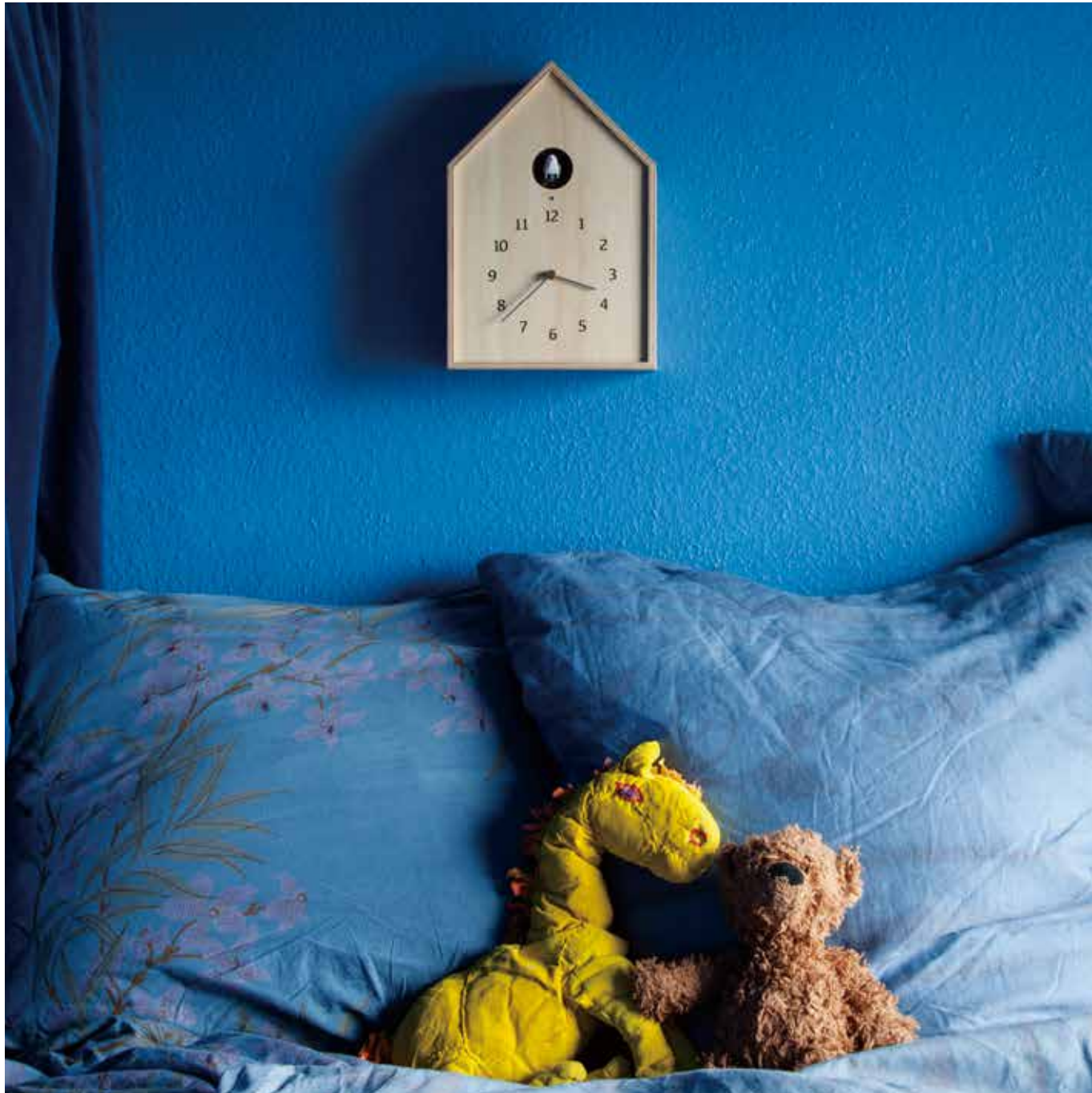
NY16-12 BIRDHOUSE CLOCK • design: yuichi nara