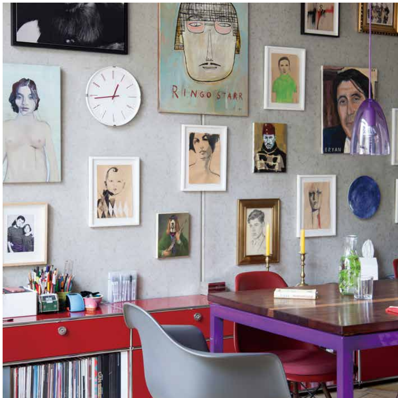
KT18-12 DRAW WALL CLOCK • design: kazuya koike