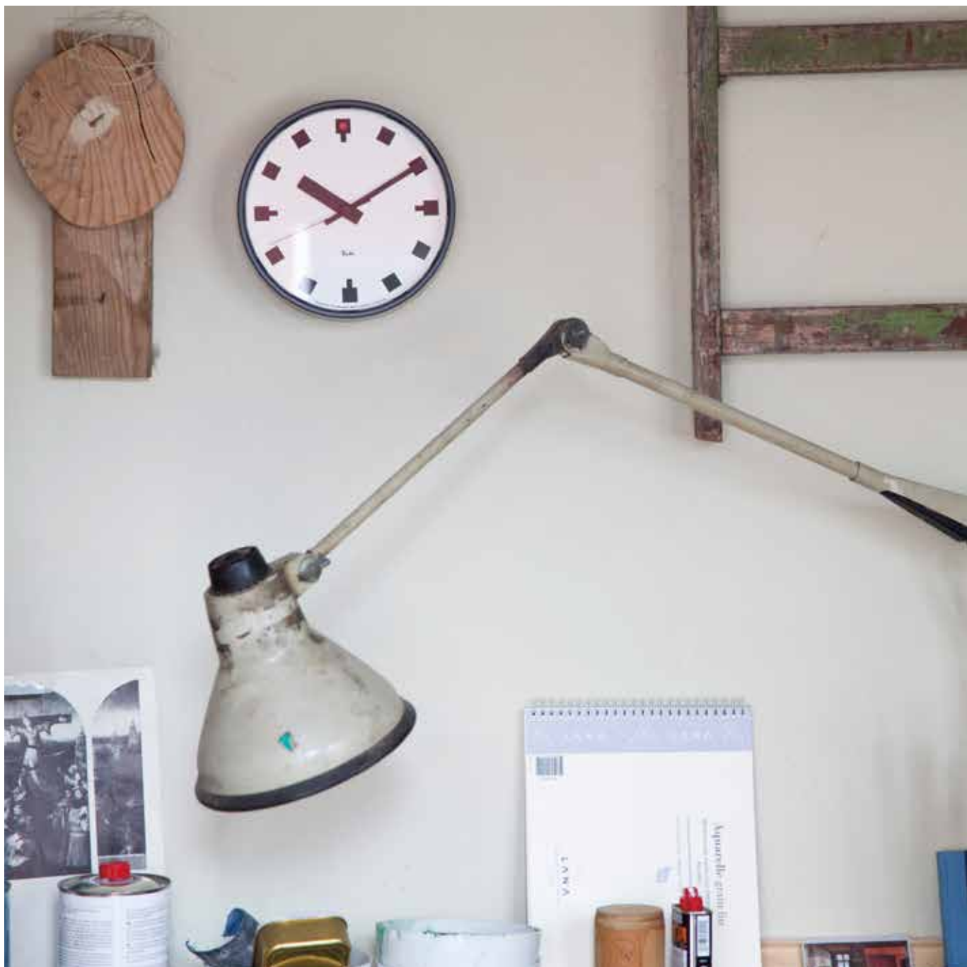
WR12-03 RIKI HIBIYA CLOCK L • design: riki watanabe